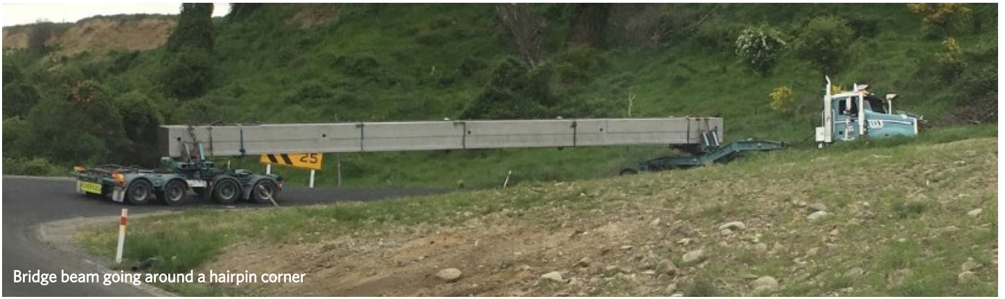
Bridge beam going around a hairpin corner