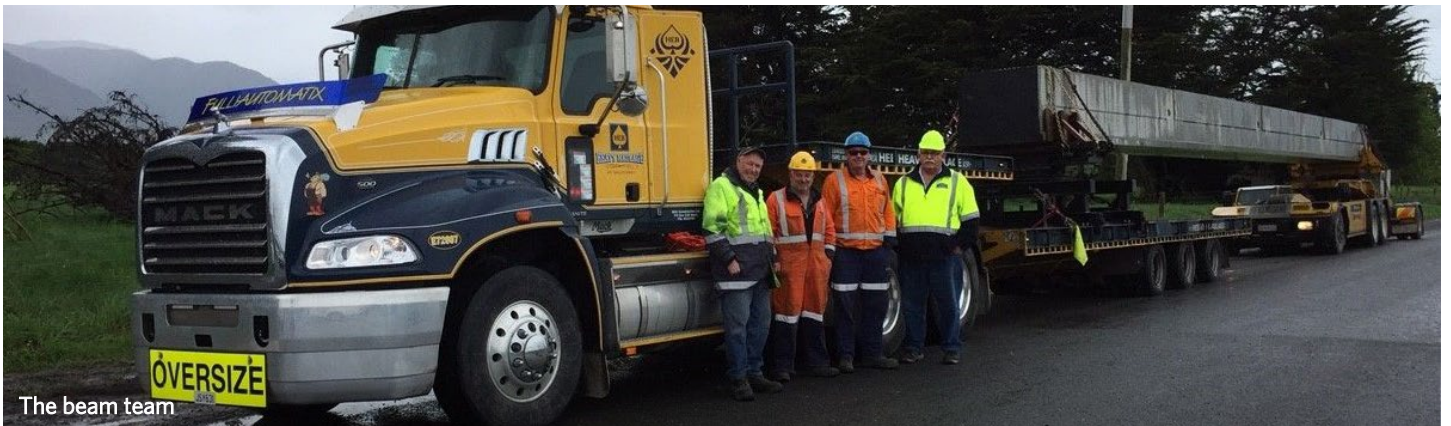
The beam team