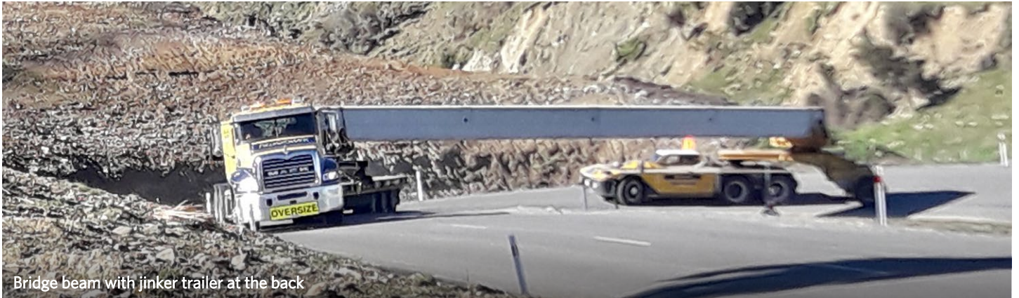
Bridge beam with jinker trailer at the back