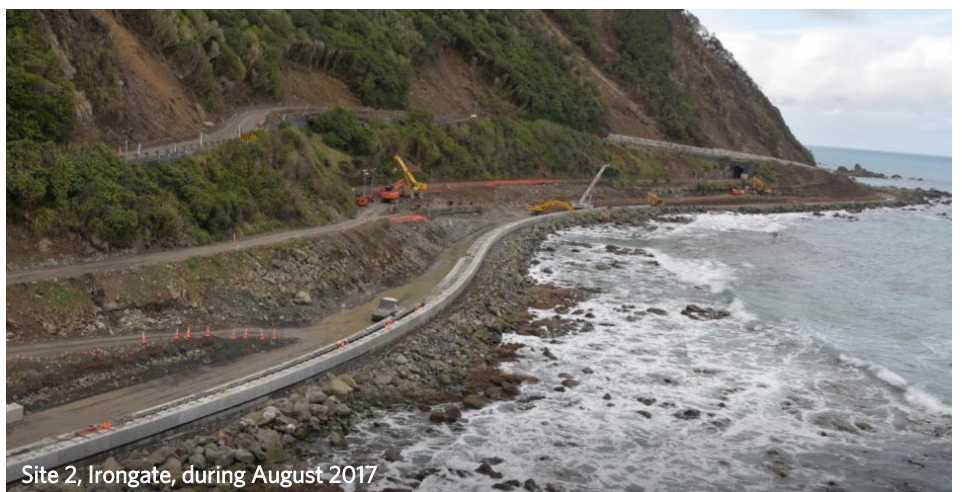
Site 2, Irongate, during August 2017

This weekly bulletin provides the latest information about the rebuild of road and rail networks damaged by the Kaikoura earthquake in November 2016. The bulletin is produced by the North Canterbury Transport Infrastructure Recovery (NCTIR) - an alliance representing the NZ Transport Agency and KiwiRail, on behalf of Government.