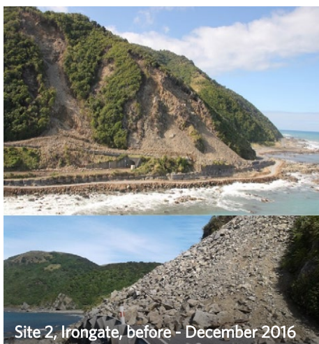
Site 2, Irongate, before - December 2016

Safety for road users on the reopened SH1 is top priority.