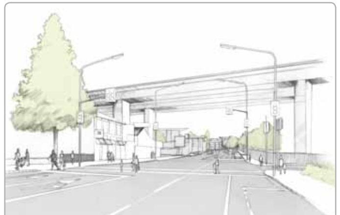
SKETCHY DETAILS An artist's impression of the new signalised crossing, which is being installed outside Newmarket's Post Office to improve pedestrian safety across the southern end of Broadway

"With over 40,000 cars travelling down Broadway every day, not to mention our busy bus lanes, too many people risk their lives on a daily basis crossing near our only Post Office. This amenity will not only be great for safety, but good for business and will help urban renewal long term."