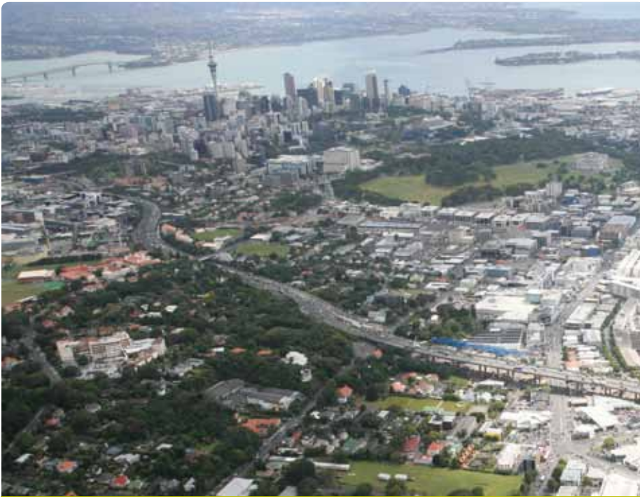
KEEP ON MOVING The replacement of the Newmarket Viaduct is just one link in a chain of improvements designed to tackle Auckland's notorious traffic woes and release the full benefits of previous upgrades to the central motorway network.