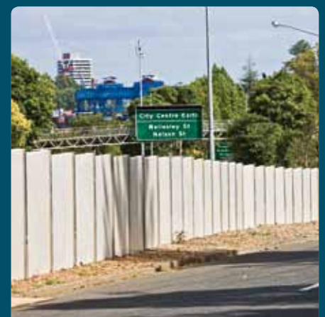
PLEASING QUIET A solid 2 metre high concrete noise wall now offers acoustic protection from motorway noise for the residents of Mt Hobson Road ... there's no hiding the Big Blue thing though!

We'll provide an update on the noise wall planting and information on the Dilworth footbridge upgrade on our website and in the next quarterly newsletter.