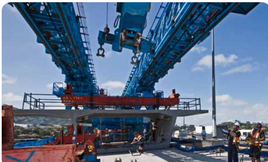
WELCOME TO THE BLUE ROOM The striking blue framework of the 120-metre long gantry houses a complex arrangement of hydraulics, pulleys and generators to facilitate safe and speedy installation of the bridge deck segments

Meanwhile at the southern abutment, the St Marks Rd on-ramp is partially open following an extended New Year closure.