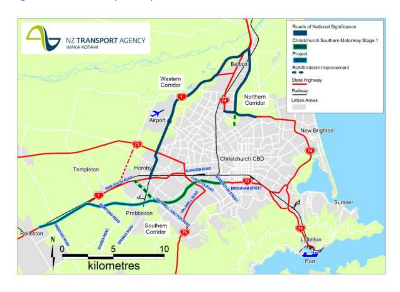
Figure 2: Christchurch motorways RoNS map