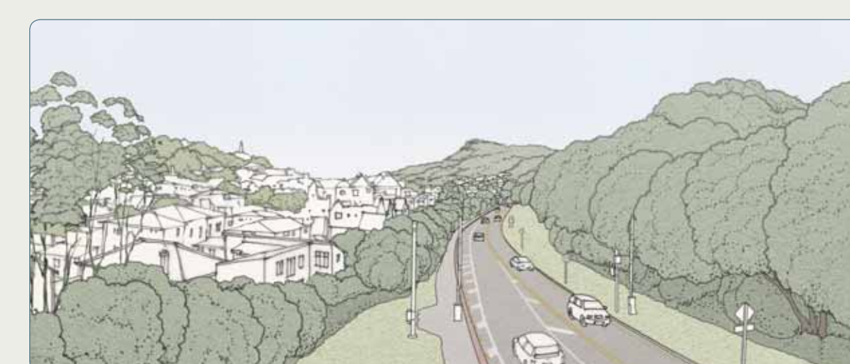
Before Ruahine Street from the pedestrian bridge looking towards Wellington Road.