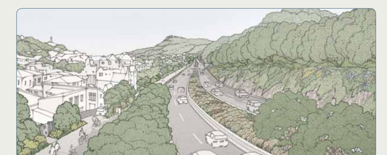
After The improvements from the pedestrian bridge looking towards Wellington Road. A pedestrian and cycle path is located between Hataitai and the widened Ruahine Street.