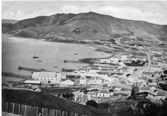
Overlooking Te Aro flat, Wellington, circa 1860, showing Manners Street through the centre.

The 1855 earthquake also raised the height of Te Aro, allowing for future land reclamations. This allowed for the creation of the Basin Reserve sports ground, which had been intended as an inland harbour of sorts. In 1857 the provincial council was petitioned to set aside the Basin Reserve as a recreational area. Work began in 1863 with the draining of the basin reserve by prison labour, and in 1866 the town board put up a fence and planted trees. The first cricket match was held there on 11 January 1868. 28