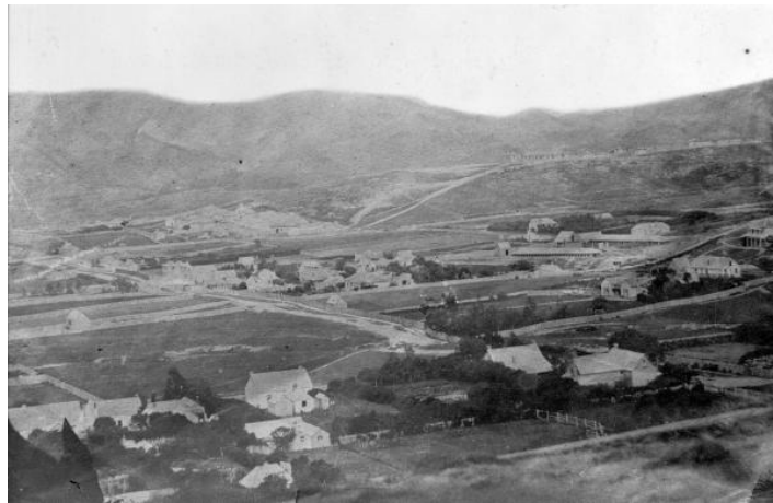
Overlooking Te Aro flat, Wellington, circa 1850s. 1/2-055704; F

While the gentry whiled away the days awaiting the allocation of their country lands, the merchants set about laying the foundations for colonial fortunes. And they did so effectively. Merchant thumbs were in many pies. 15