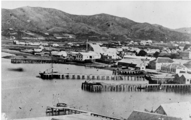
Te Aro foreshore, Wellington, circa 1850s-60s. 1/2-028493; F

Economically dominant, Te Aro residents presented a challenge to the existing social order, which the New Zealand Company wished to retain. An important and well cited example of this is the 1841 anniversary of settlement celebrations. The organisation of these celebrations illustrates a clear split between Thorndon and Te Aro, or the ‘aristocracy’ and ‘democracy’ as suggested by Wakefield. 19