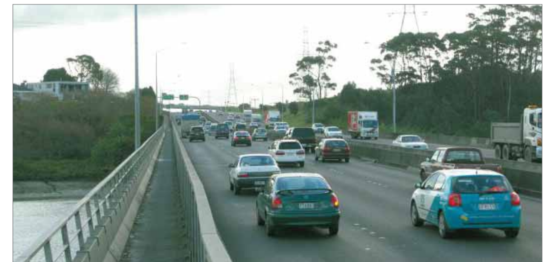
Figure C-2.4: Photo 2-3 Existing view westwards crossing the Whau River on the off-road route