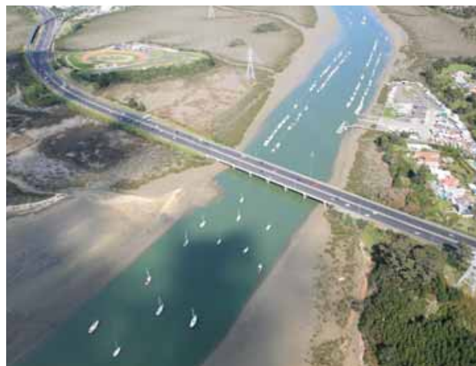
Figure C-2.1: Aerial view of the sector 2 from the north

Sector 2 works include widening of the motorway across the Whau River crossing, and on reclaimed land near Rosebank Domain. Additional reclamation is proposed to enable improved stormwater treatment, with the additional benefit of relocating the northwestern cycleway further away from the vehicle traffic.