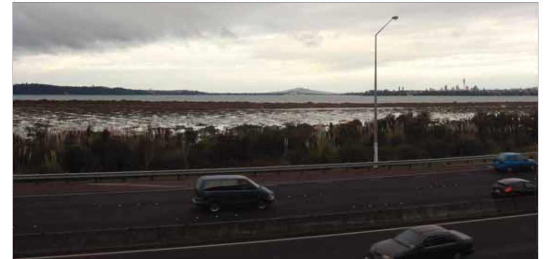
Figure C-2.2: Photo 2-1 Existing view to the north adjacent Rosebank Domain on off-road route