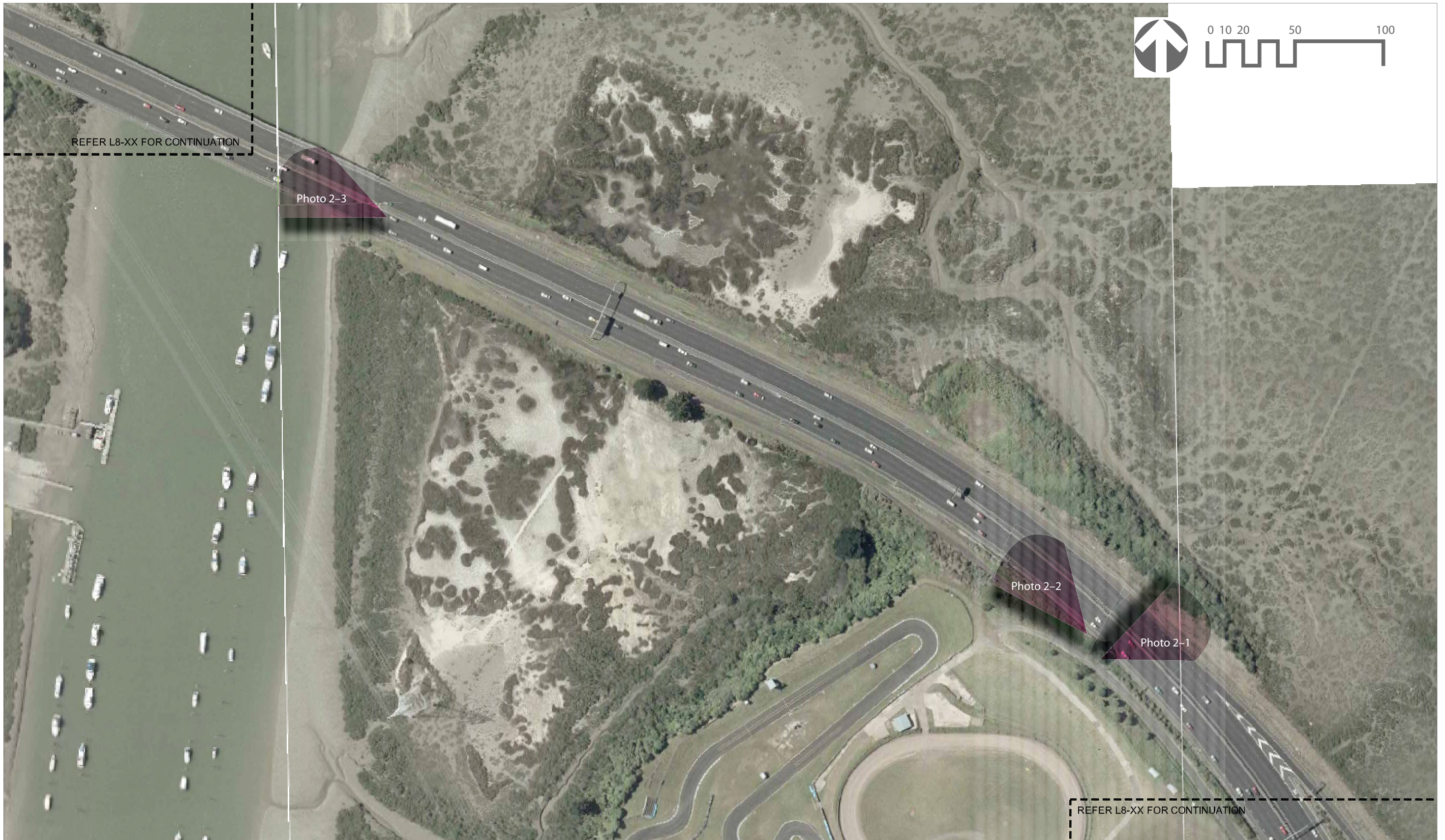
Figure C-2.5: Whau River existing plan