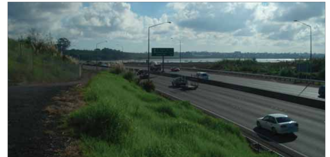
Figure C-2.3: Photo 2-2 Existing view westwards adjacent to Rosebank Domain