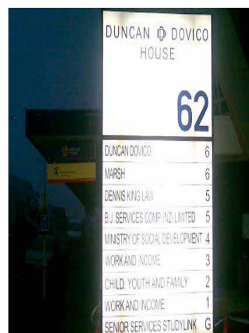
Figure 6.4 Illuminated stacked sign