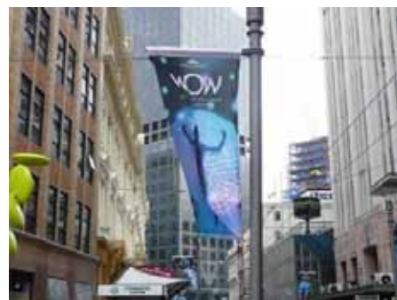
Figure 4.9 Flag