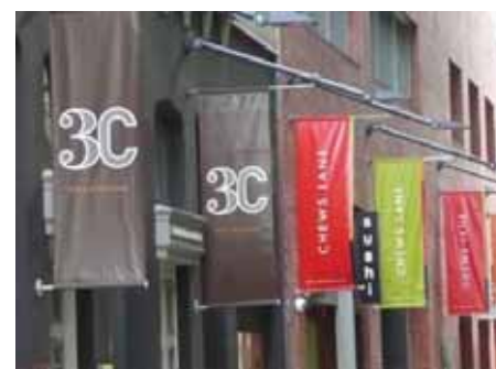
Figure 4.7 Vertical banners