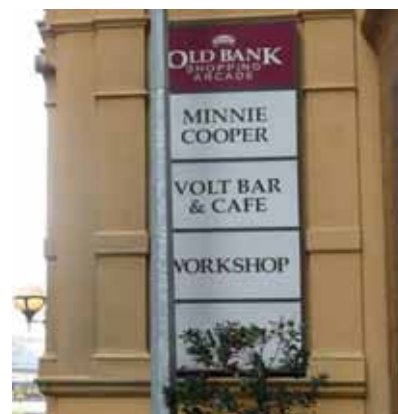
Figure 3.4 Directory board showing various stores rather than using individual advertising signs