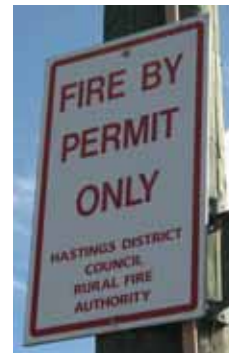
Figure 4.12 Example regulatory 'Fire by permit only' sign