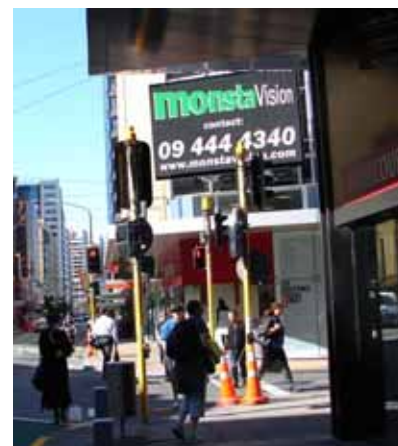
Figure 3.3 Large video/VMS signs located at busy city intersection facing oncoming traffic.

In relation to state highways, the Agency typically delegates its authority to the TA in urban areas. However, in rural areas, the network maintenance contractor or consultant is typically responsible for the monitoring and enforcement of advertising signs.