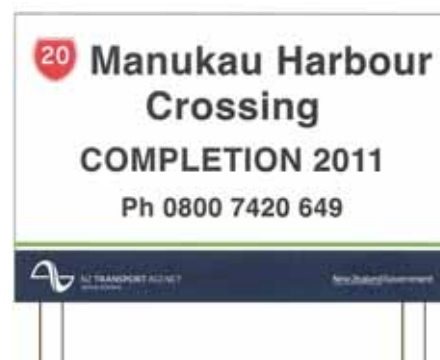
Figure 4.10 Construction site sign