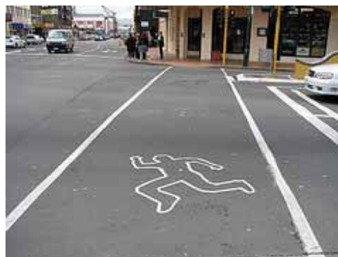
Figure 3.2 Road safety advertising campaign marked on the road

Under Clause 13.7 (d) of the TCD Rule, advertising on traffic signs is not permitted. No person shall 'install a traffic control device that bears a logo, monogram, sign of sponsorship, sign indicating an association with a business, or any information other than that specified in this rule.'