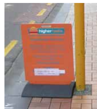
Figure 6.1 Complicated advertising sign that is difficult to read

In general, advertising signs can inform road users of the location of a commercial enterprise and may assist the movement of traffic with good directions to popular commercial centres providing the message is not confused with a traffic instruction.