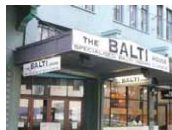
Figure 1.2 Veranda fascia advertising sign