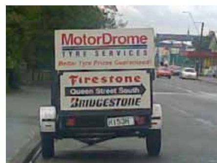
Figure 4.15 Advertising as the purpose