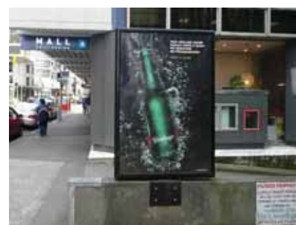
Figure 4.3 Free-standing sign