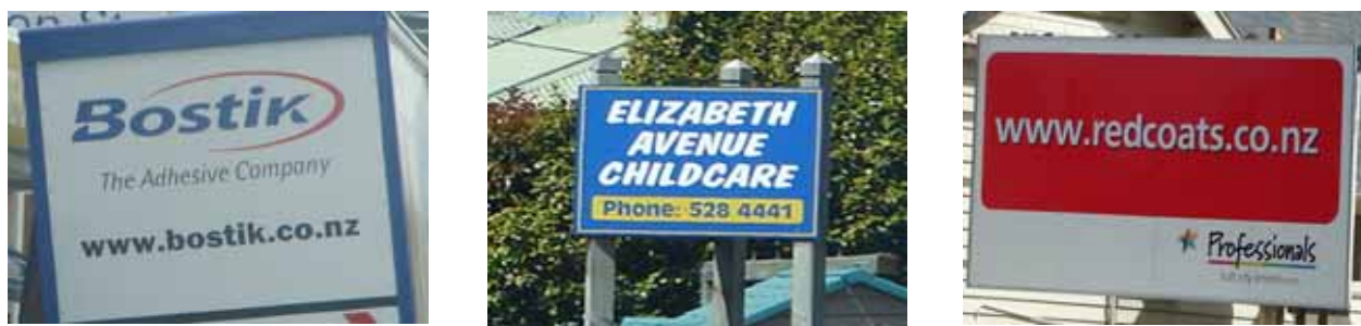
Figure 6.7 Sign examples showing clear backgrounds which enhances the legibility of the message