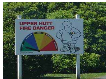
Figure 4.11 Fire hazard sign