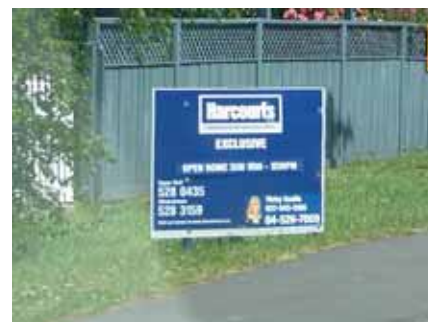
Figure 4.1 Typical real estate sign