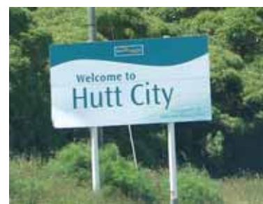
Figure 6.6 Lettering hierarchy examples. All examples show the most important message in larger font