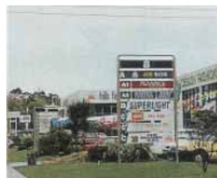
Figure 5.2 Off site advertising signs grouped together to avoid excessive clutter

To avoid excessive clutter of roadside advertising signs, it is recommended that TAs/RCAs restrict the installation of off-site advertising. Such an approach is a practical method of controlling the proliferation of roadside advertising. It is noted however that provided controls are adequate to ensure orderly and legible displays, there is no reason why an off-site advertising sign should have more of an adverse effect than a similar on-site sign. Indeed, in some situations in rural areas, off-site advertising in advance of or in close proximity to a site may serve its purpose more safely and effectively than on-site advertising.