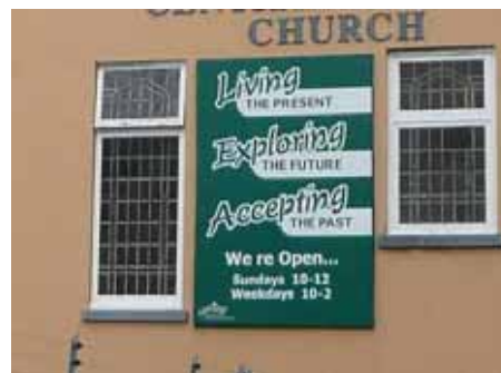
Figure 4.5 Wall mounted sign

Banners may also be located above the roadway. It is suggested that TA's could cater for the demand for banner advertising over the roadway by setting up a small number of specific sites where banners may be installed such as the sides of over-bridges (Figure 4.8).