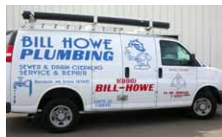
Figure 4.14 Business-related advertising