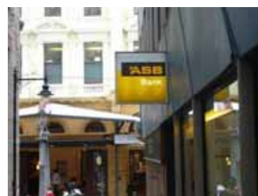
Figure 1.1 Tavern sign