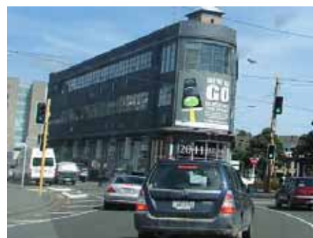
Figure 6.2 Inappropriate advertising signs that looks like traffic signals

Advertising signs and messages should also comply with the Code of Ethics provided by the Advertising Standards Authority (refer section 3.2).