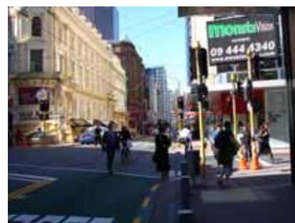
Figure 6.5 Inappropriate use of variable message sign as it is located at busy city intersection

For general design principles and specifications for variable message signs refer to Part 1 of the TCD manual as well as the NZTA Fixed variable message sign design guide .