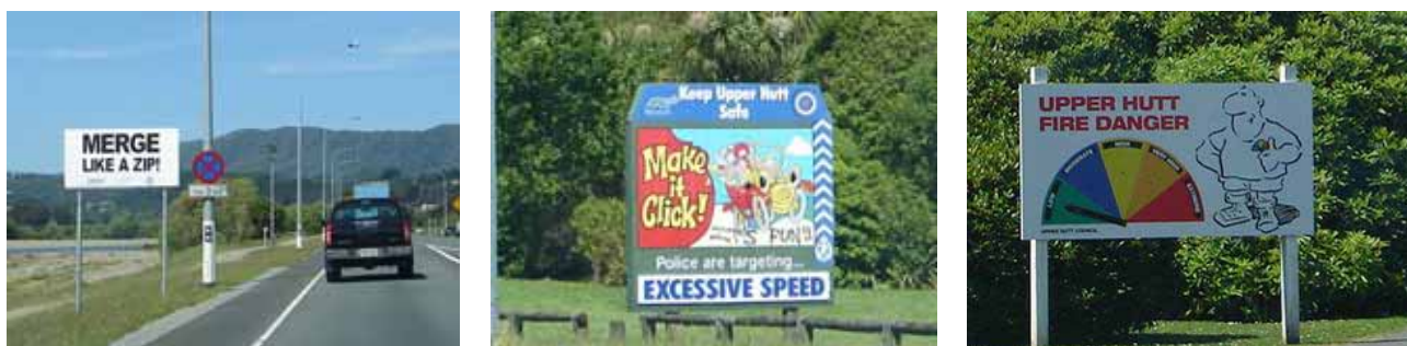
Figure 4.2 Examples of types of billboards.