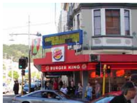
Figure 6.3 Corporate identification

A recognisable advertising sign style is a means of establishing a corporate identity - particularly for an advertiser with multiple signs. Such signs may make their message clear at a glance and may make a positive contribution to the visual environment.