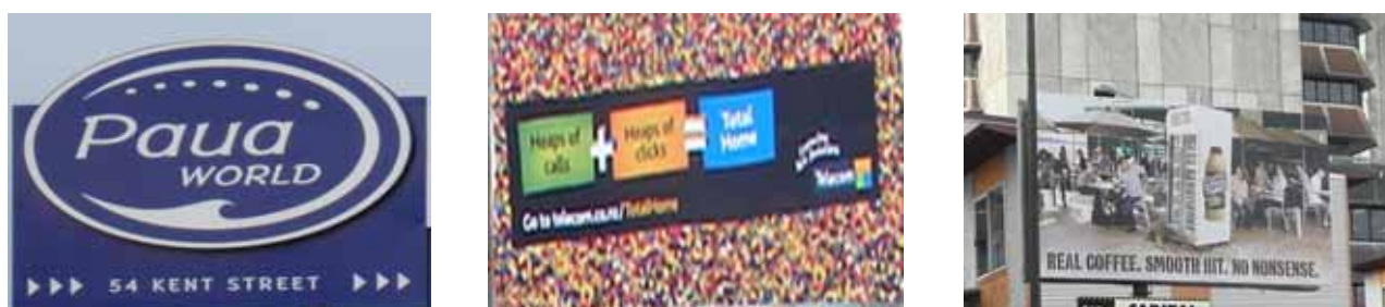
Figure 6.8 Sign background examples. The first sign shows good contrast, while the other two photos indicate poor contrast and legibility as the colours of the billboard and message blend into the rest of the sign and the buildings behind it.

The contrast between the message and the background on the sign also affects legibility. The message should stand out from the background colour with colours of a similar tone tending to merge into one another, particularly from a distance.