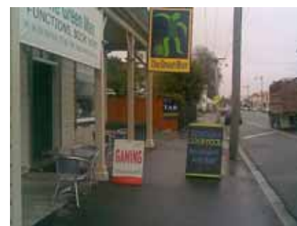
Figure 4.4 Sandwich boards blocking footpath

Many TAs have specific policies in relation to licensing for the use of signs on footpaths.