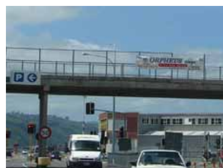
Figure 4.8 Banner on bridge