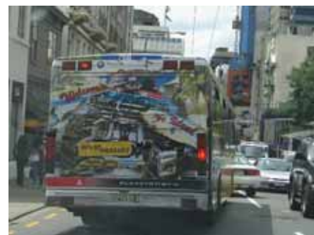
Figure 4.14 Advertising incidental to operation

This type of vehicle mounted advertising refers to vehicles which display advertising which does not refer to their normal purpose. Examples of this include buses which are painted to advertise various products and services. (Figure 4.14)