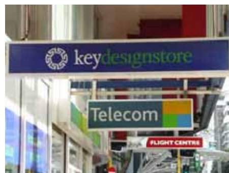
Figure 4.6 Under veranda sign