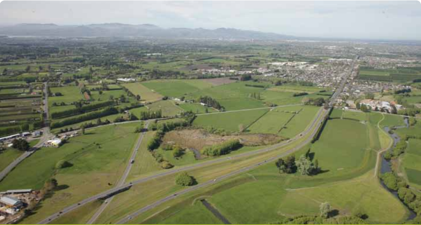
LOOKING SOUTH FROM EXISTING NORTHERN MOTORWAY

The CCC is responsible for the design and construction of any links from QEII Drive into the city to ensure traffic flows freely into and out of Christchurch.