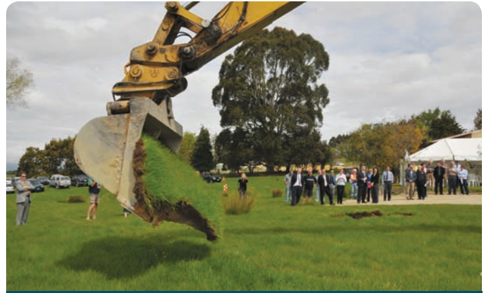
Heavy machinery courtesy of the contractor helped turn the first sod of earth on the project.