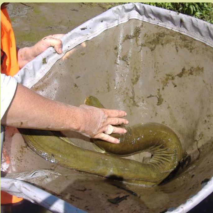
Staff have had to get up close and personal with the eels that have needed relocating as a result of the project.