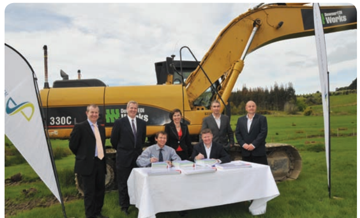
The contract is signed and now it's time for the real work to begin.