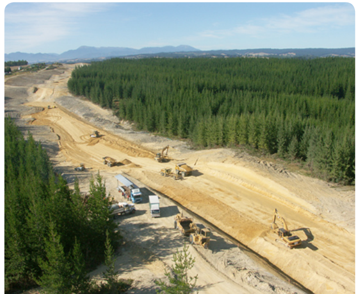
Progress has been swift on the new section of state highway with the former forestry land clearly resembling a work site.

Approximately 60-70 people attended the sod turning ceremony, including representatives of NZTA, Tasman District Council, former MP Damien O'Connor, residents associations and local iwi. A blessing of the project and site was performed by iwi representative Gladys Taingahue before a 30 tonne digger was used to break ground on the project.