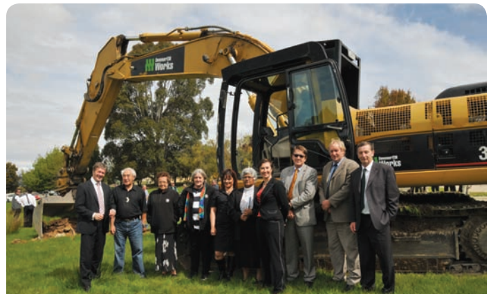
Representatives from NZTA, iwi and Tasman District Council were on hand to help celebrate the official start to the Ruby Bay Bypass Project.