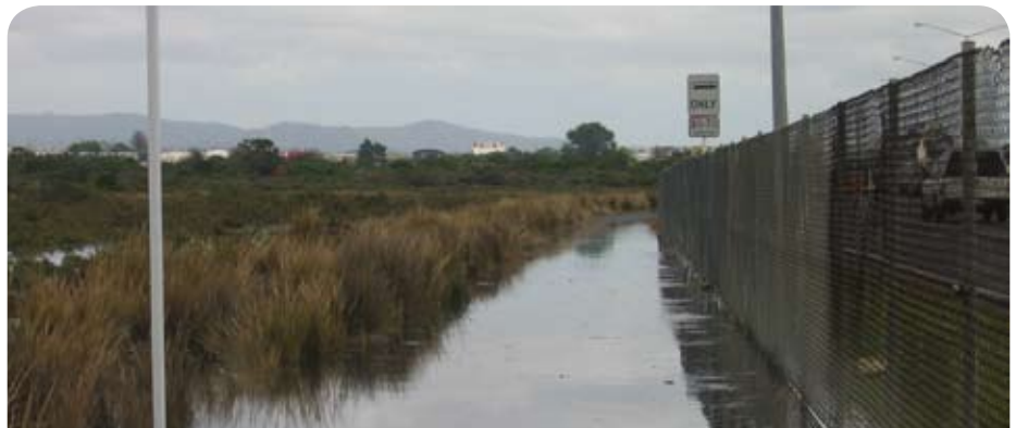
THE NORTHWESTERN MOTORWAY and cycleway floods during high tides.

Important information for property owners on next page