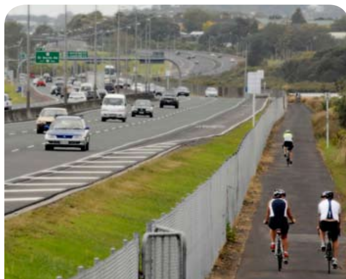
Motorists and cyclists will benefit from raising and widening the causeway