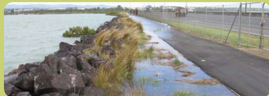
The motorway and cycleway will be less prone to flooding when the improvements are completed

Climate change and rising sea levels mean that flooding may become more frequent in the future. The newly widened motorway will be built on higher ground to reduce this risk.