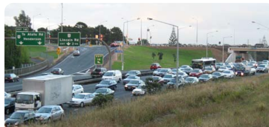
Widening SH16 between Waterview and Te Atatu will provide extra capacity and ease congestion