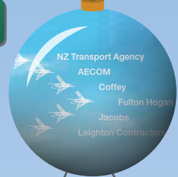
6 project partners