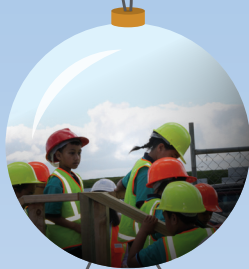
7 kids with hats on