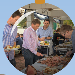
4 blokes a-munching