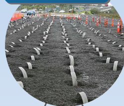
11 (thousand plus) wick drains