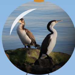
2 herons resting