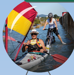
5 limbs a-paddling