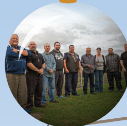
9 traffic gurus