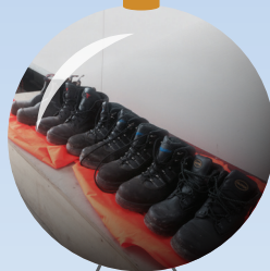
10 safety steel caps