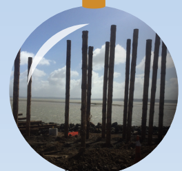
12 timber piles

The Causeway Alliance thanks you for your support during 2014 and wishes you and your family a safe and happy holiday season.