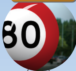
8 and zero speed, max