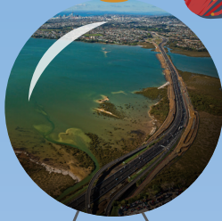
1 beaut job on SH16