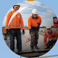
3 lads a-working