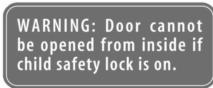
Figure 6-2-1. Approved child safety lock sign (white text on red background)

Small passenger service vehicle means a vehicle used for use in a passenger service for the carriage of passengers that is designed or adapted to carry 12 or fewer persons (including the driver).