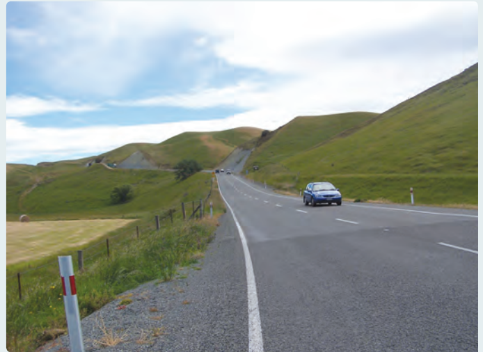
The existing road alignment looking north towards the Lions Back Hill summit.

The recent design phase, carried out between September 2009 and May 2010, has seen the final design agreed, resource consents approved and land purchase agreements completed.