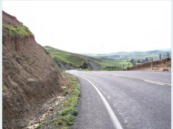
This view shows the existing road looking south from the summit.