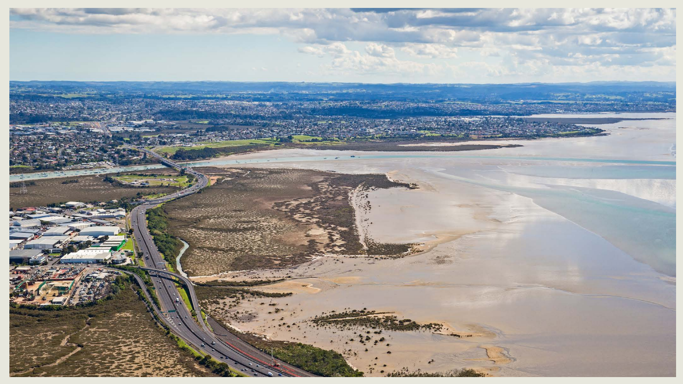
View towards Te Atatu Peninsula with SH16 in the foreground.