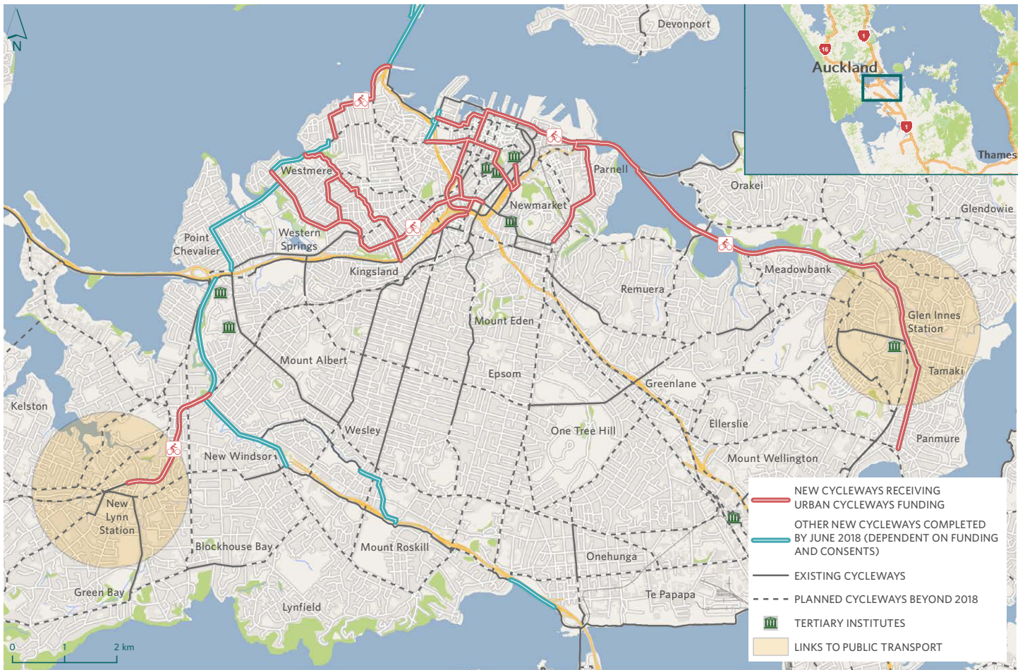
Cycleways refers to both on and off-road facilities