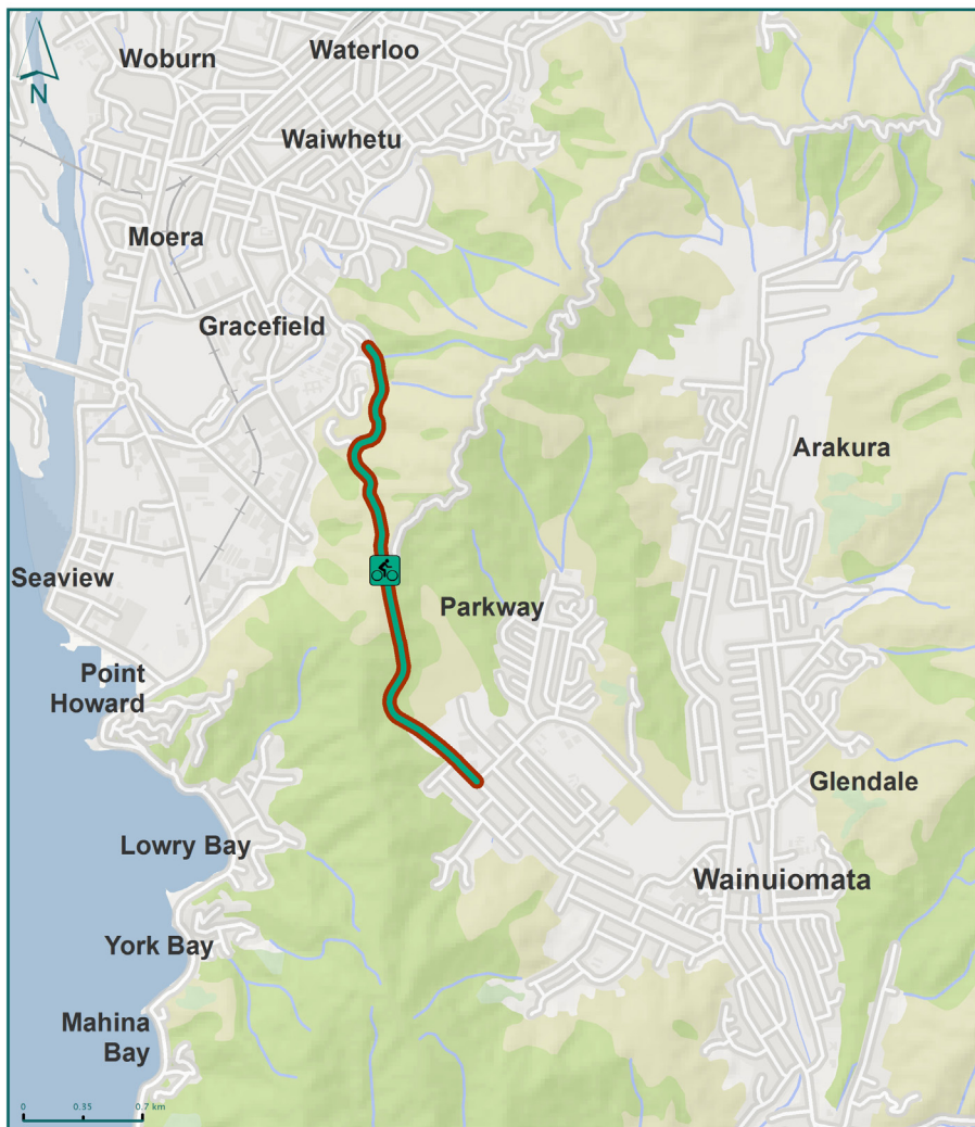
Wainuiomata Hill Cycleway