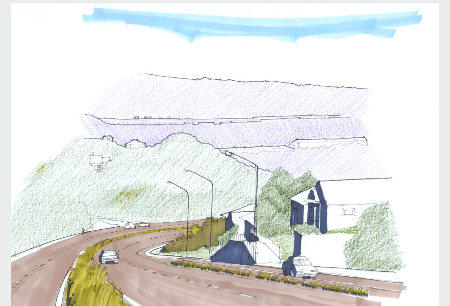
Caversham Valley Rd - View west from corner of Burnett Street