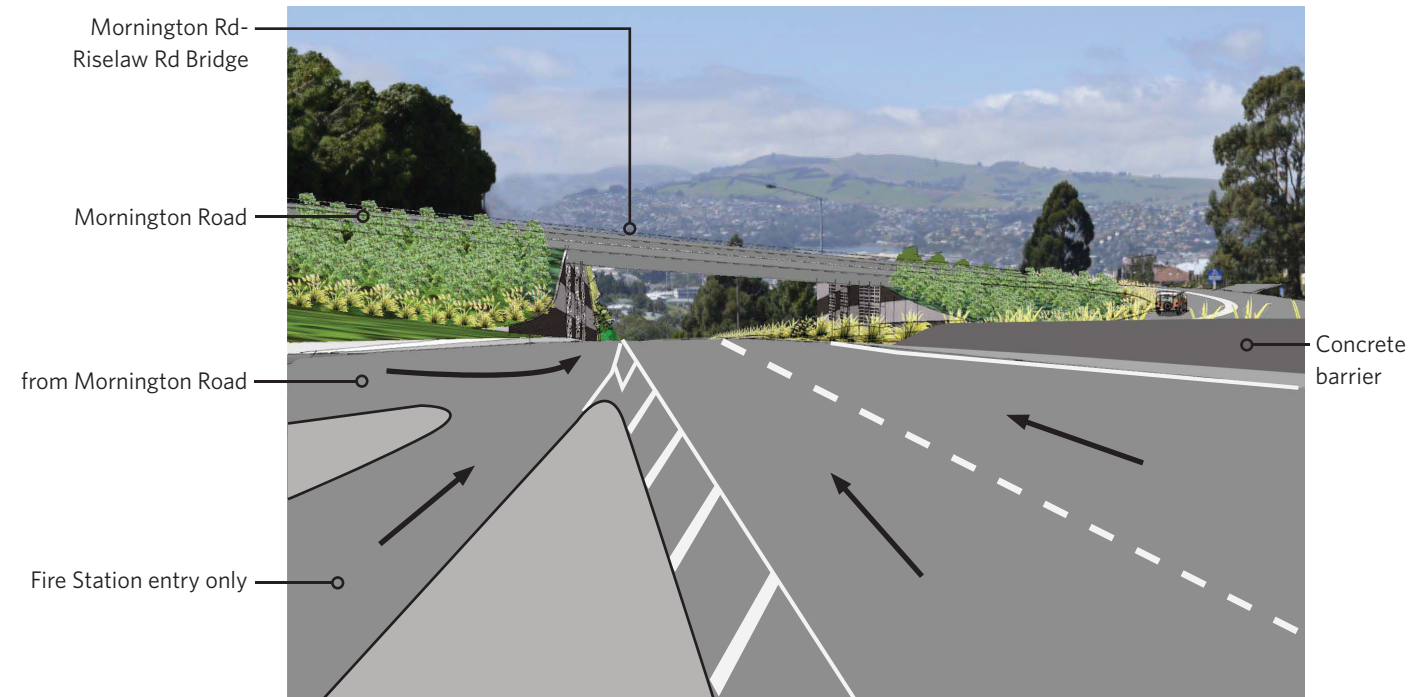
View north to new bridge