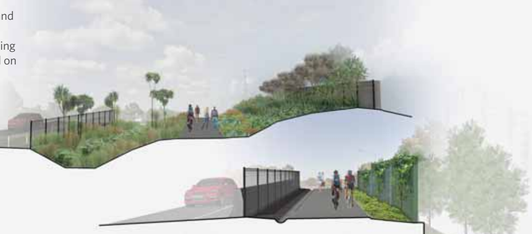
Artist's impression of what a narrow area of the shared path could look like