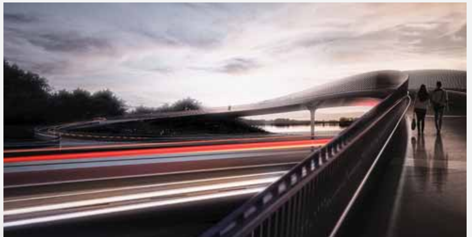
Artist's impression only of what the bridge across the motorway at Papakura could look like