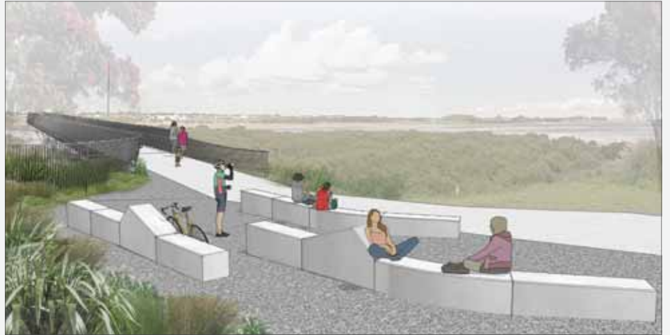
Artist's impression of what a rest area on the shared path could look like

If you would like to discuss the walking and cycling improvements, we invite you to attend the community presentation evening on Thursday 26 th November - as detailed on page 4.