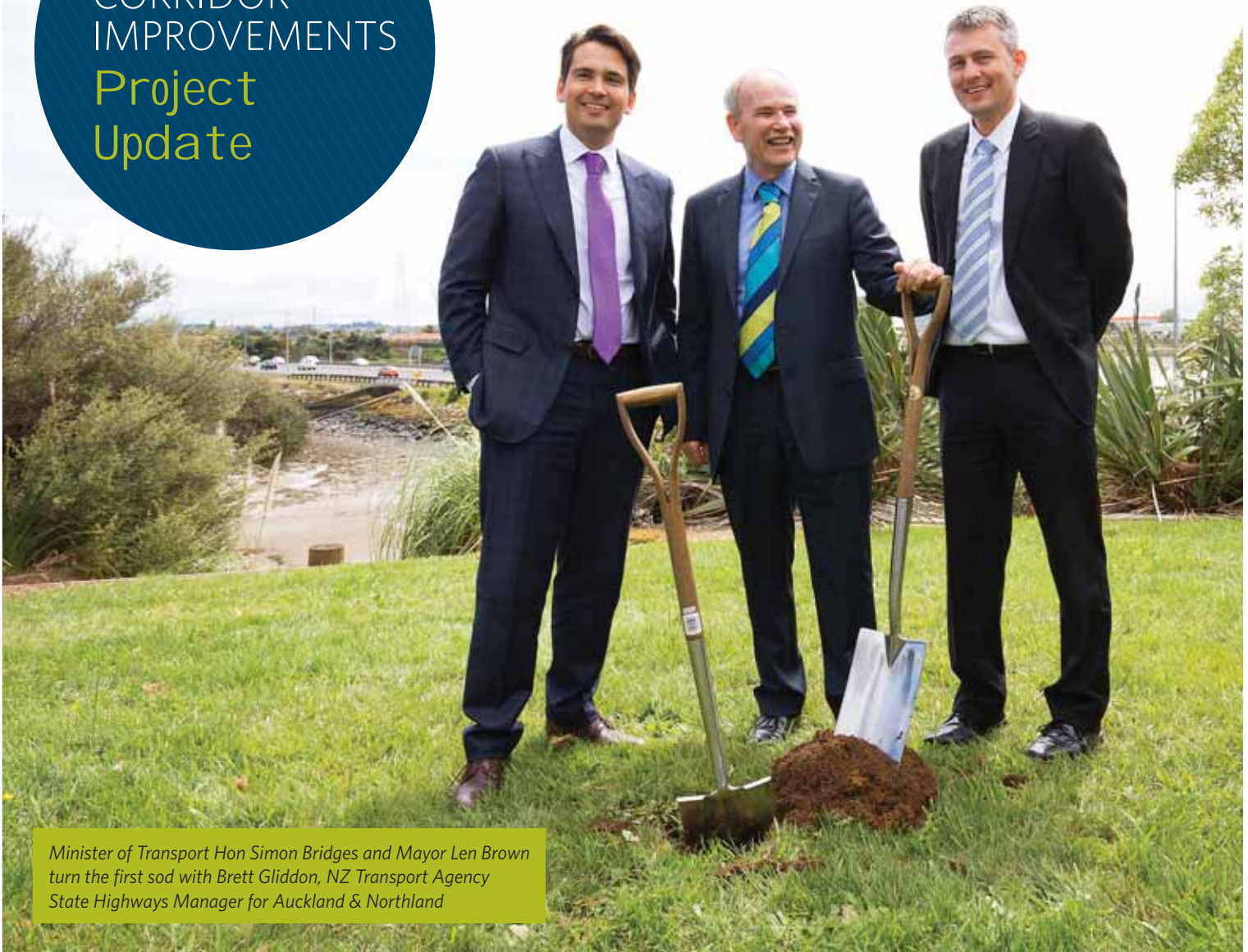
Minister of Transport Hon Simon Bridges and Mayor Len Brown turn the first sod with Brett Gliddon, NZ Transport Agency State Highways Manager for Auckland & Northland