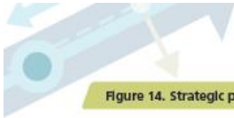
Figure 14. Strategic principles – Ngauranga to Airport Corridor