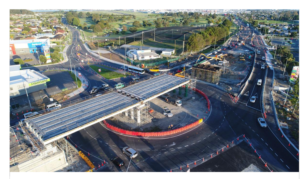
Bayfair roundabout before and after the beam lift