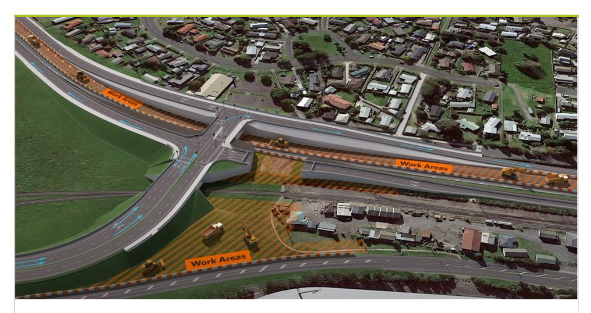
Illustration of the partial opening of the Te Maunga interchange

Prior to the end of the Bay Link project, the underpass will close for final completion work. At that time, people walking and cycling will be able to cross via the new Bayfair roundabout pedestrian crossing.