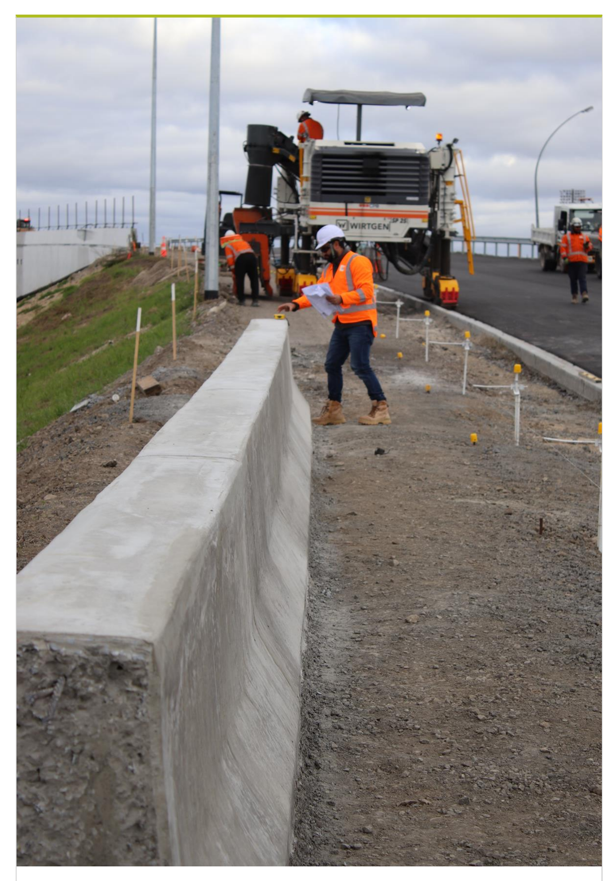
The slipform paver machine leaving a line of freshly minted barriers in its wake

The interchange has also been home to a slipform paver machine over the last few months. This specialist piece of German machinery, believed to be one of few of its type in New Zealand, has been used for barrier construction. Unlike precast barriers (which are manufactured offsite) or in situ barriers (where concrete is poured into stationary formwork on site), the slipform machine produces barriers while in motion. Concrete is added to one