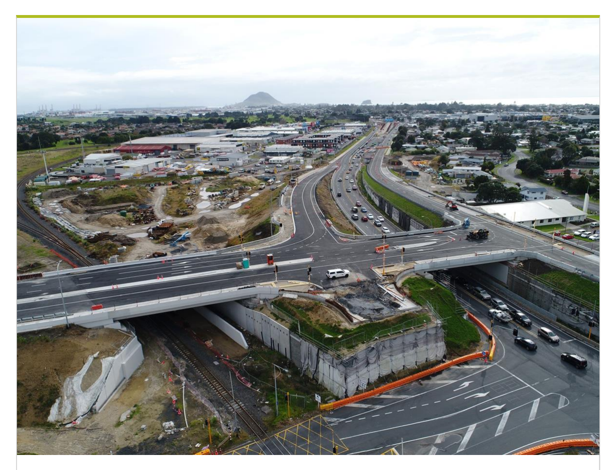
SH2/29A Te Maunga interchange in early June 2022

Now, Te Maunga is home to a new roundabout on SH29A, two bridges and three of the four 'legs' of the interchange (pictured above). Work to complete the fourth leg, the Tauranga Eastern Link (TEL) off-ramp, will commence once the interchange has been partially opened.