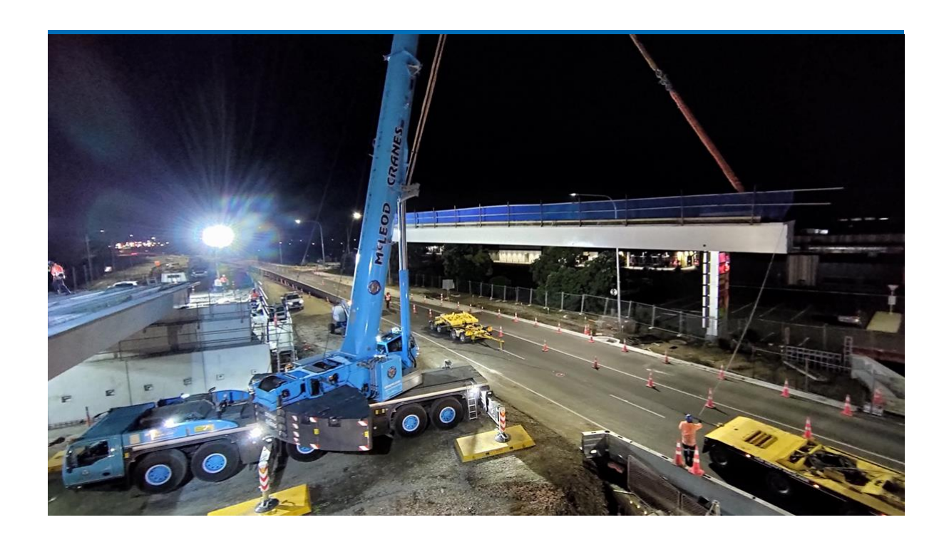
Lifting 24 beams into place forming the four-span flyover at Bayfair roundabout between April and August 2022.