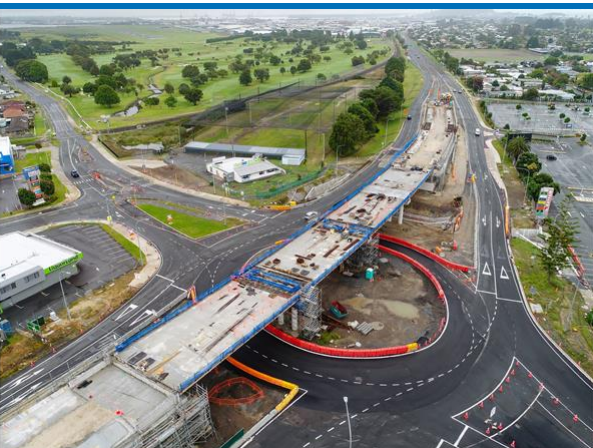
Bayfair roundabout and flyover in February 2022 and in December 2022.