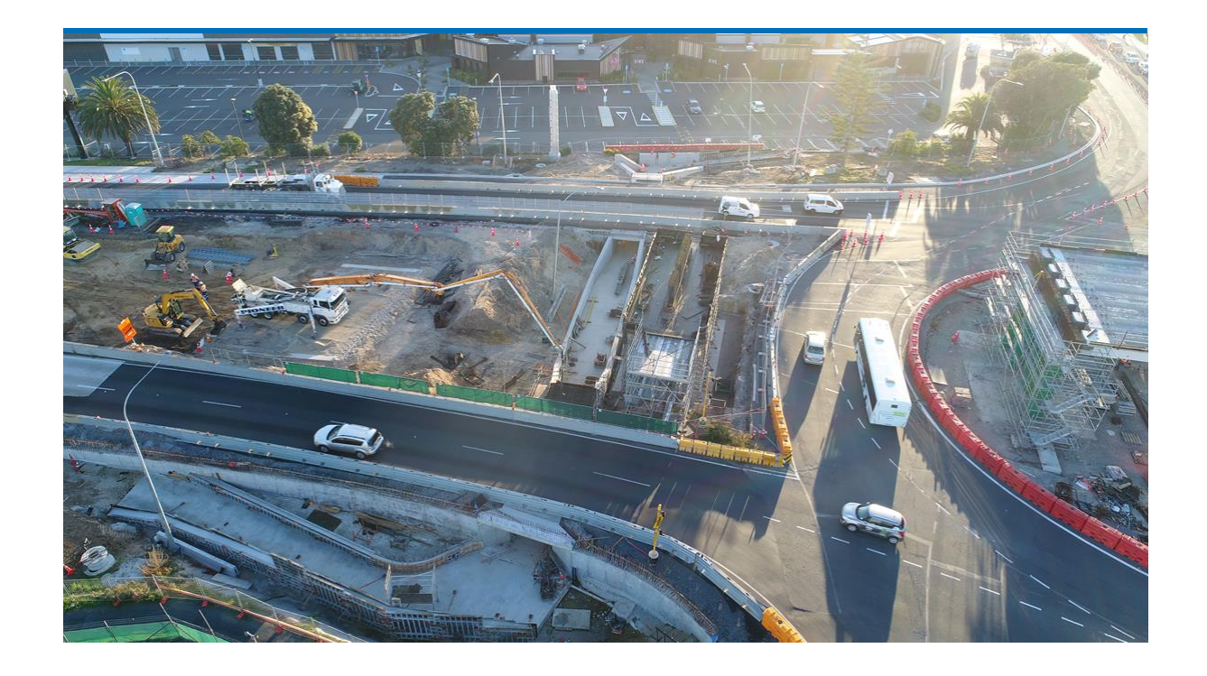
Making the SH2 underpass at Bayfair available for use in April.