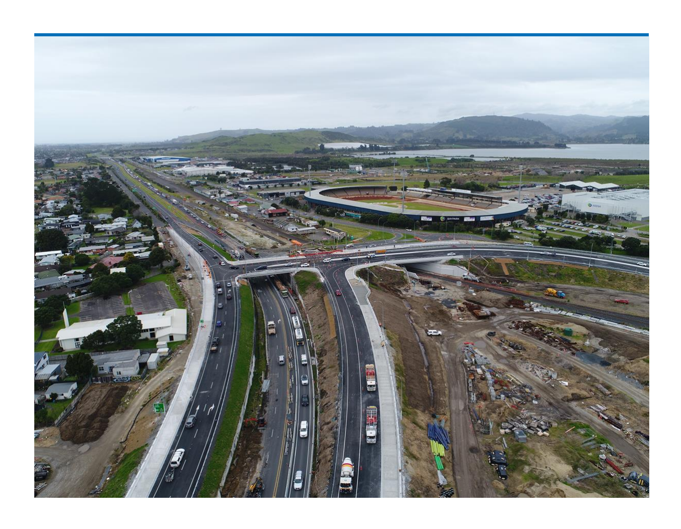
Partial opening of the new SH2/29A Te Maunga interchange at the Baypark end of the project in July.