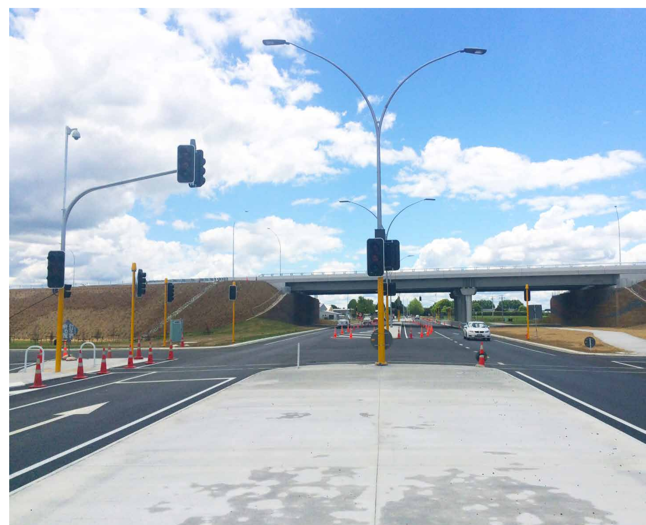
Victoria Road interchange traffic signals

Hamilton City Council manage these signals on behalf of the NZ Transport Agency.