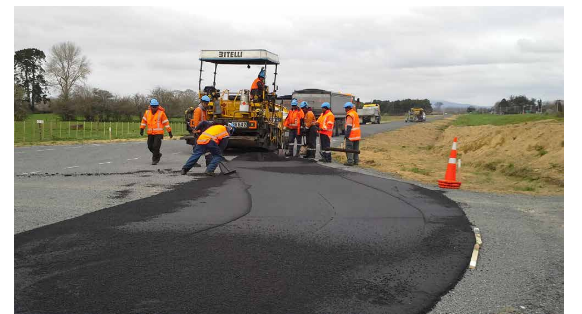
OGPA being laid

Traffic management will be needed to lay the OGPA and some delays and lane closures will be required. These will be advertised well in advance of this work happening.