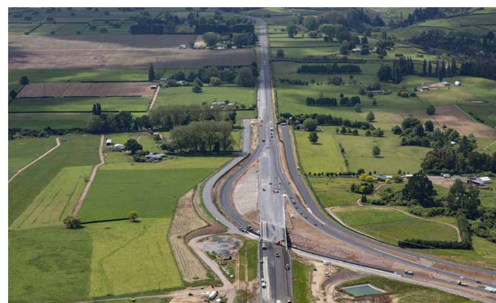
Top: Northern interchange. Bottom: Southern interchange