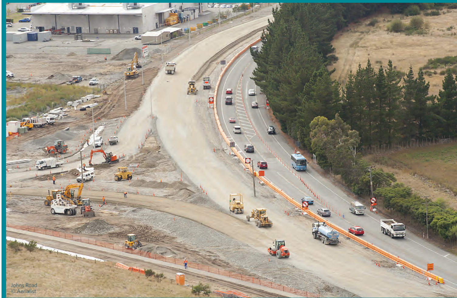
Johns Road