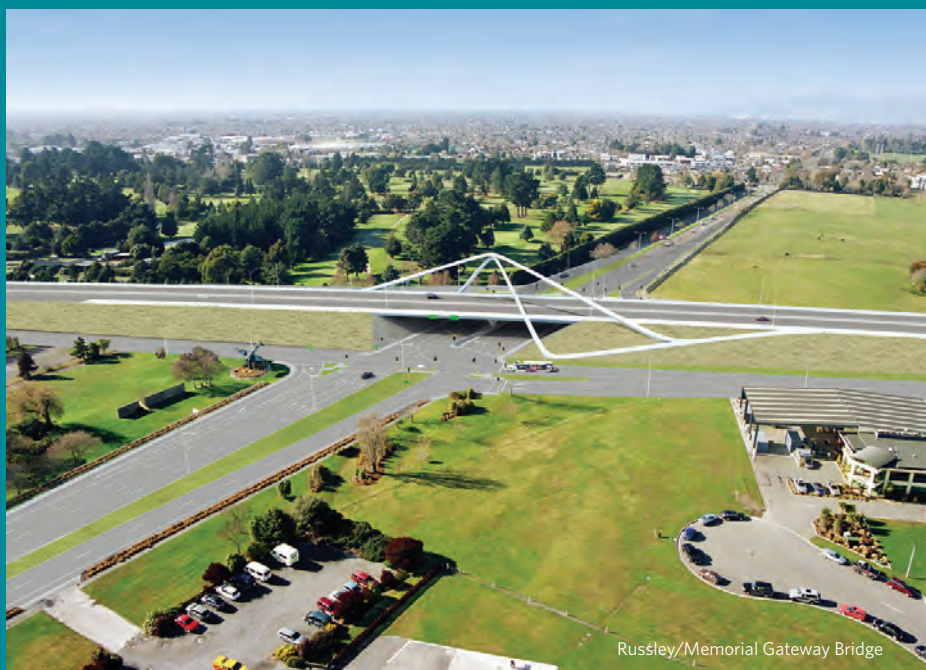
Russley/Memorial Gateway Bridge