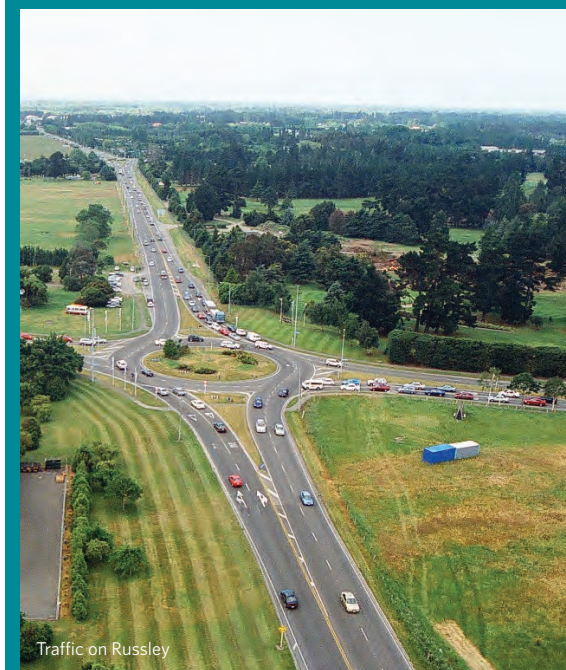
Traffic on Russley

An introduction to the Christchurch roads of national significance project