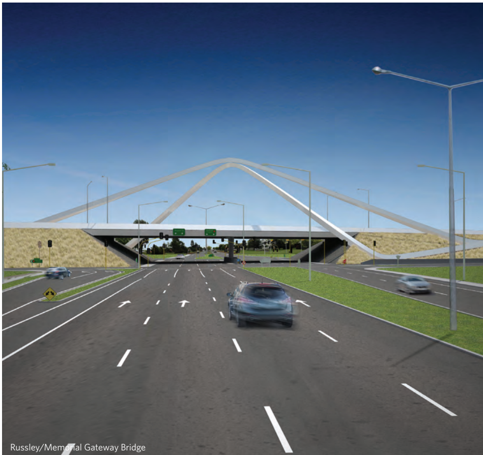
Russley/Memorial Gateway Bridge

The government's investment in this project will not only increase the capacity of roads to handle increasing freight traffic, but will improve safety for all road users. In addition it will provide an injection of government money into the local construction industry, providing employment and other benefits for our region. By improving our roads, we are supporting the rebuild and improving our future.