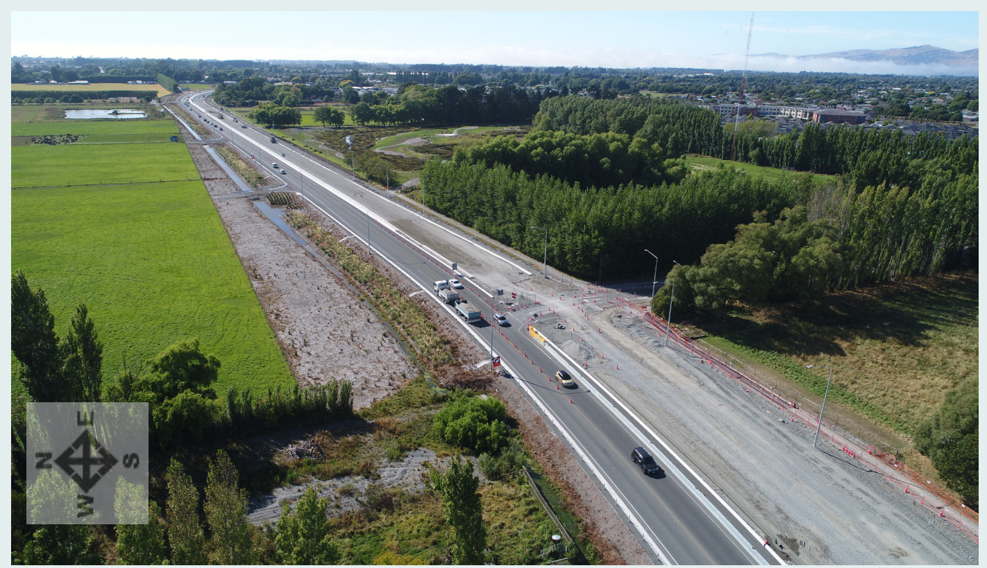
Work on New QEII Drive westbound lanes is progressing well, we were able to complete the work on Philpotts Road just before the level 4 lock down, from 25 March Philpotts Road was open again for left out only onto QEII Drive.