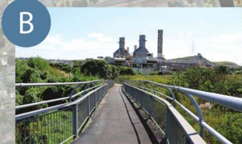
MIGHTY RIVER POWER