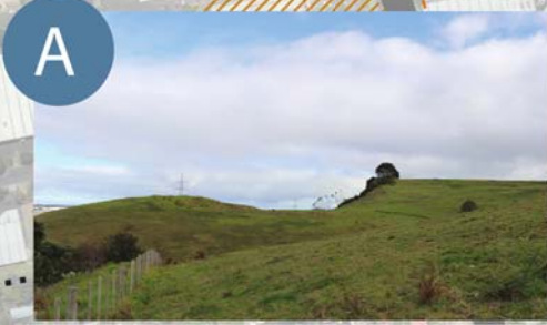
MUTUKARO (Hamlins Hill Regional Park)