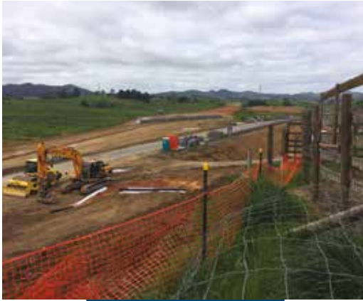
Huntly Northern Interchange