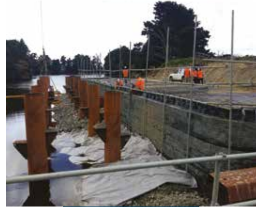
Mangatoketoke Stream Bridge