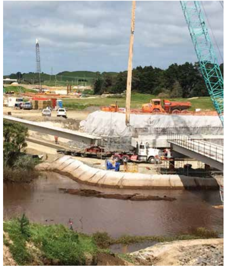
The beams were put in place on the Komakorau Stream bring during October.

With a 30-metre span the Komakorau bridge has pre-cast concrete beams, while structural steel is required on the longer bridges of the Mangawara (50m), Whangamairie (40m) and Mangatoketoke (42.5m) bridges.