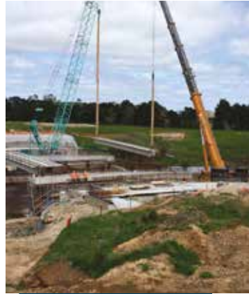
Komakorau Stream Bridge