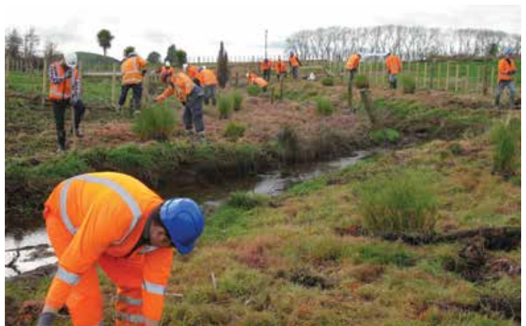
Volunteers helped with planting after the area was fenced

Signs will be installed at a later date at the site detailing the mudfish habitat and mitigation planting.