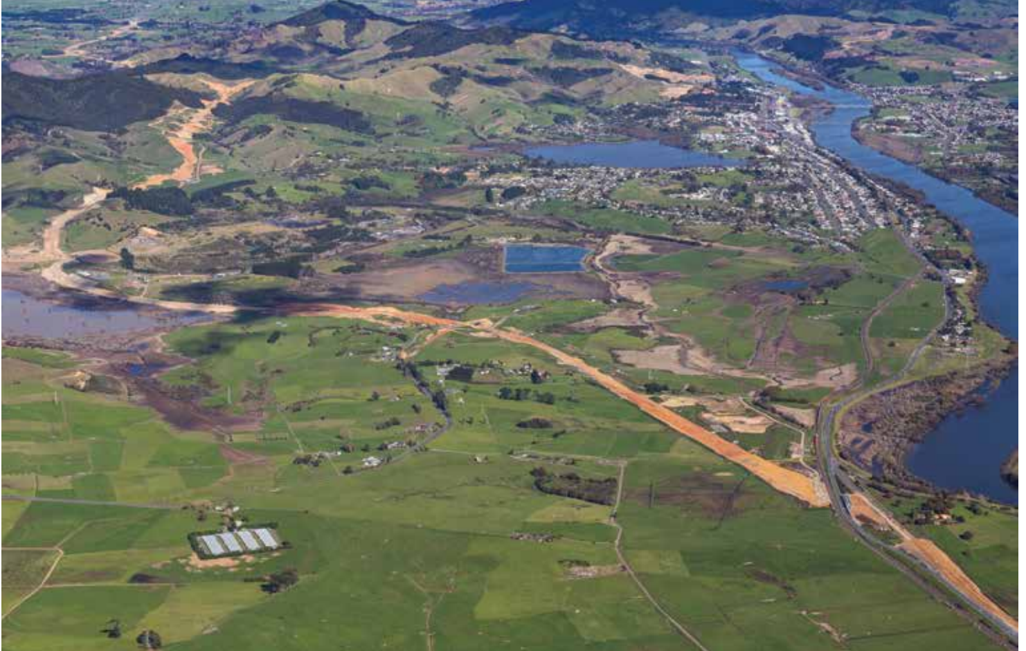
A view of the Huntly works from north to south