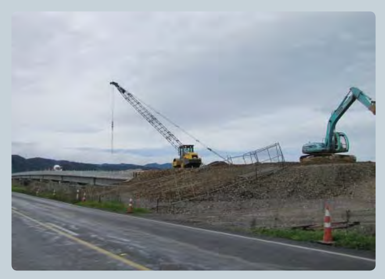
Concrete\ trucks\ and\ construction\ vehicles\ can\ now\ drive\ on\ to\ the\ bridge\ from\ the\ western\ end