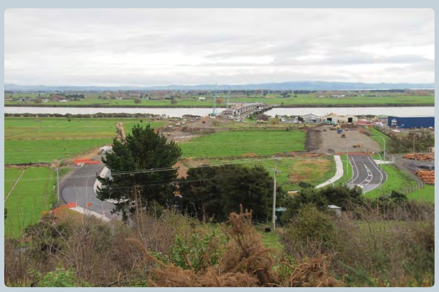
The SH25/26 roundabout is obscured by the trees in the foreground. The road on the left shows the route the approach roads will take. The road on the right will connect with a future local link road from the roundabout to the Kopu industrial area