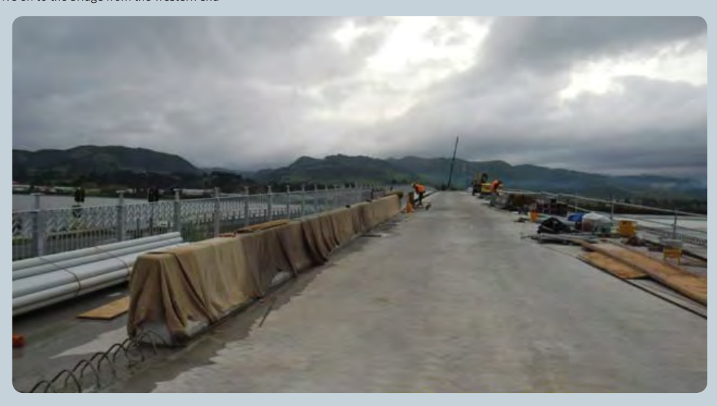
The barrier separating traffic from cyclists and pedestrians is under construction. It features moulds that produce special designs. Each day, the moulds are removed from yesterday's six-metre section and a new section is cast and the concrete poured