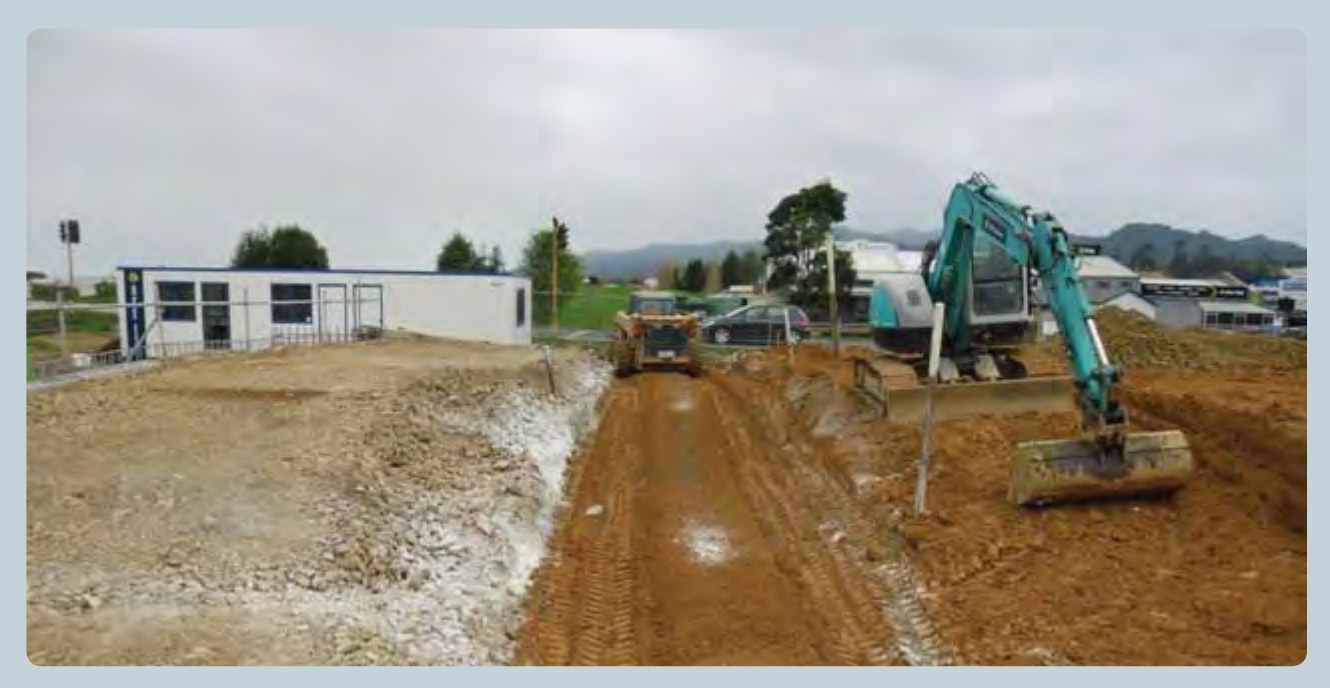
To build the western approach to the bridge, a gap was dug in the Waihou River stopbank. Construction staff are shown replacing the stopbank materials prior to building the approach road