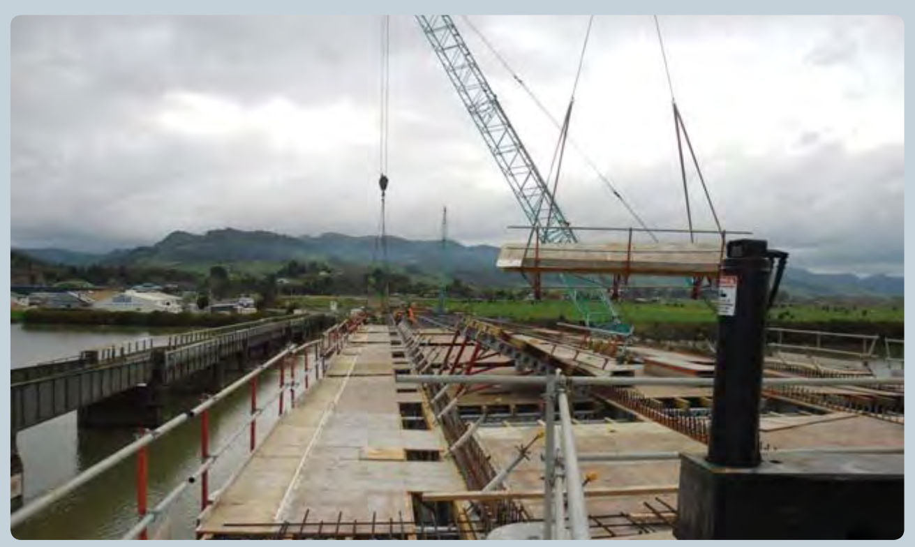
Wooden formwork is placed on top of the bridge beams to form the mould for a new section of bridge deck