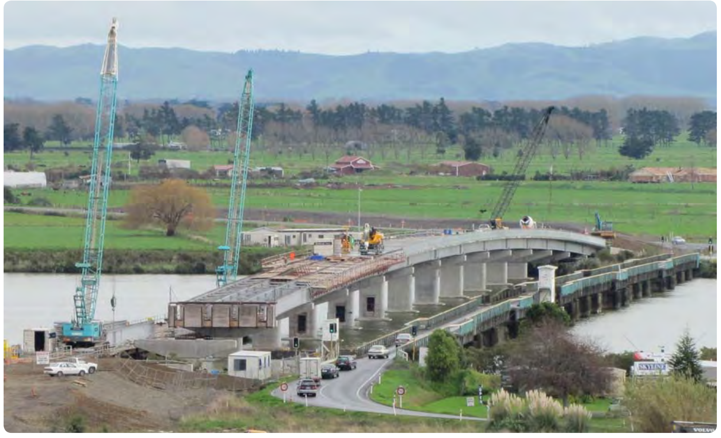
Construction of the bridge is nearing completion. Road construction will follow as soil settlement targets are reached

With the new Kopu Bridge structure nearing completion, the focus of this project is about to shift from bridge building to road construction.