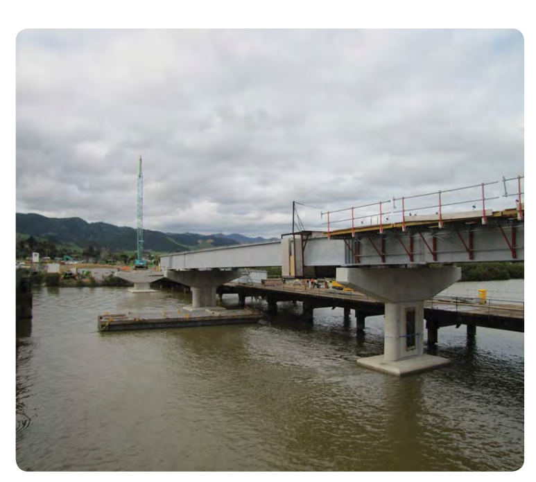
All the concrete piers that support the bridge are finished and the final bridge beams are about to be laid

In this project update, we decided to let the photos do the talking.