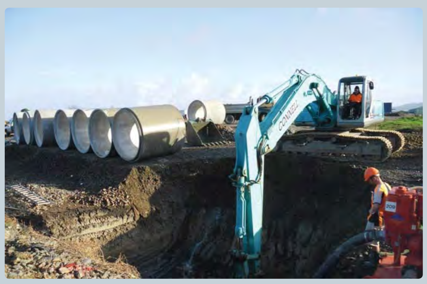
A 2.1 metre culvert is placed under the bridge approach road to provide drainage under the approach road