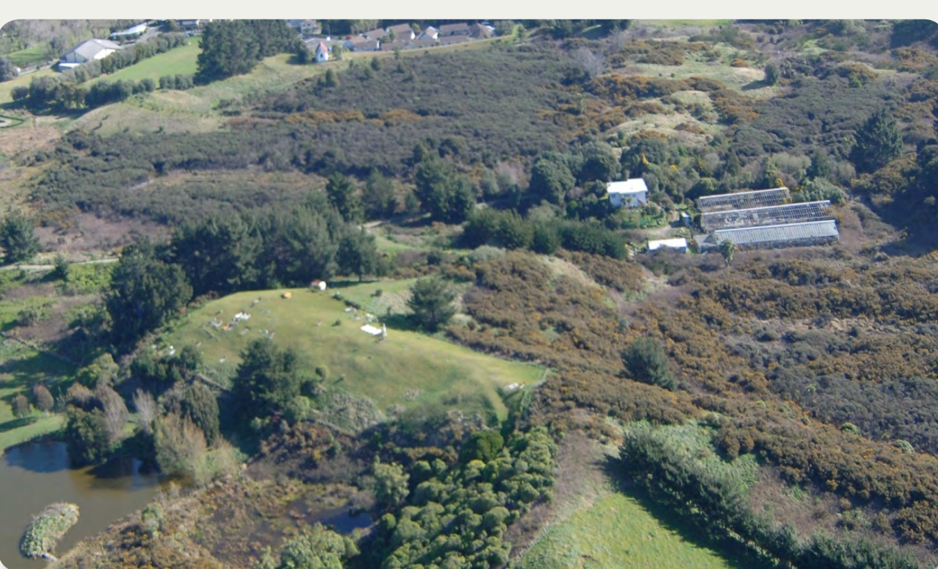
Left: Greenaway Homestead is an example of early European occupation and sits within a landscape of mature vegetation. Right: At Waikanae the urupa (burial ground) on the dune above Puriri Road is a significant cultural heritage place for Maori.