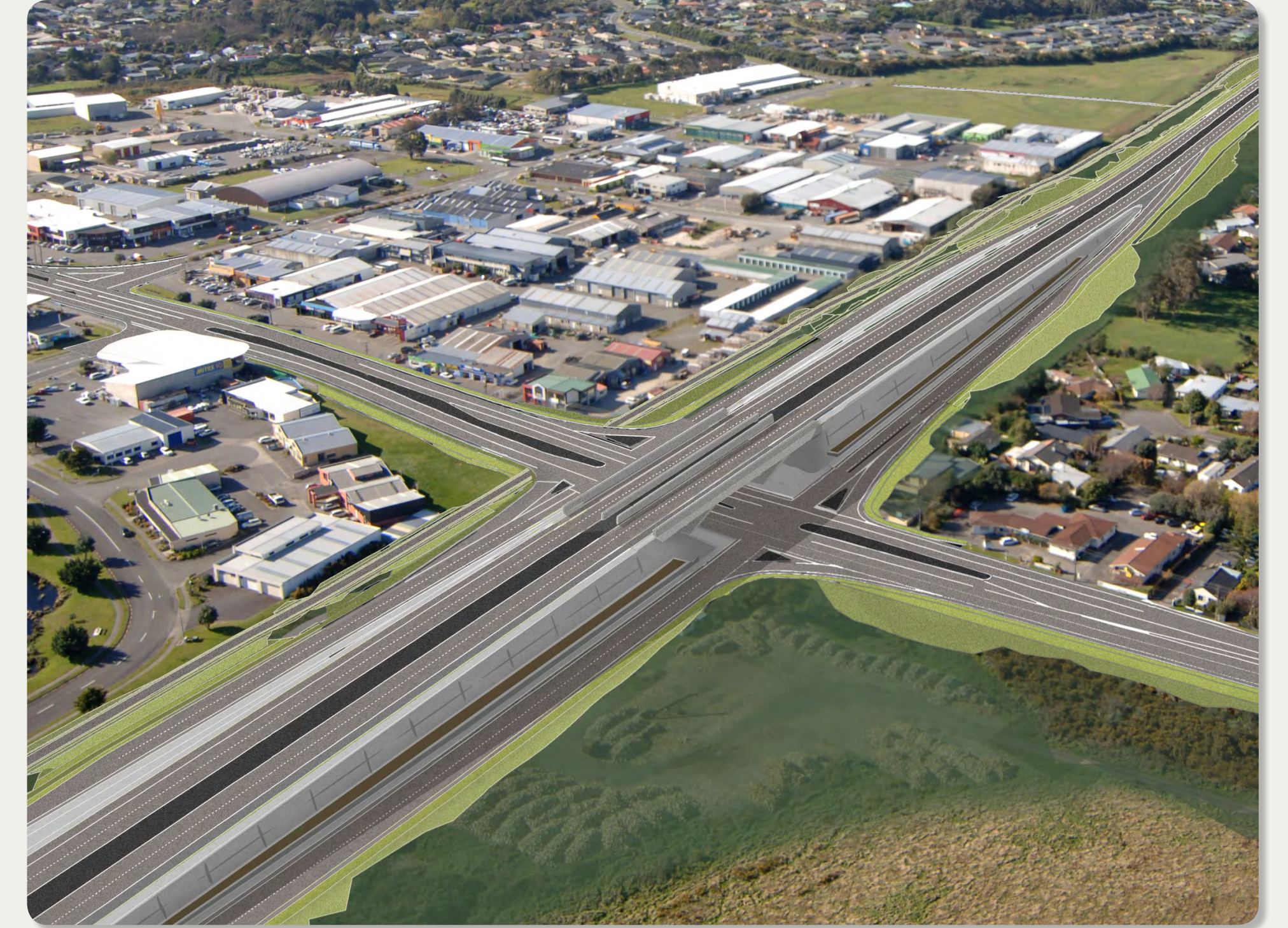
Indicative aerial view of the Kāpiti Road expressway interchange. The shared cycle/walk path can be seen on the left side - before mitigation work.