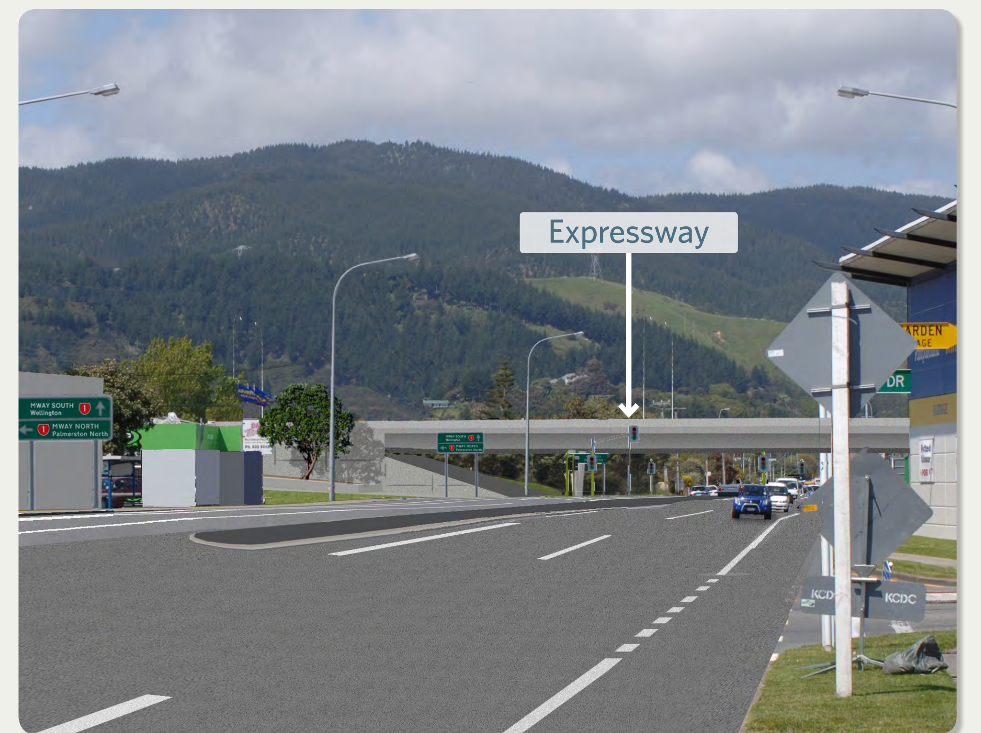
Indicative street level view looking east on Kāpiti Road with the hills in the distance - before mitigation work. The bridge design detail has yet to be undertaken.