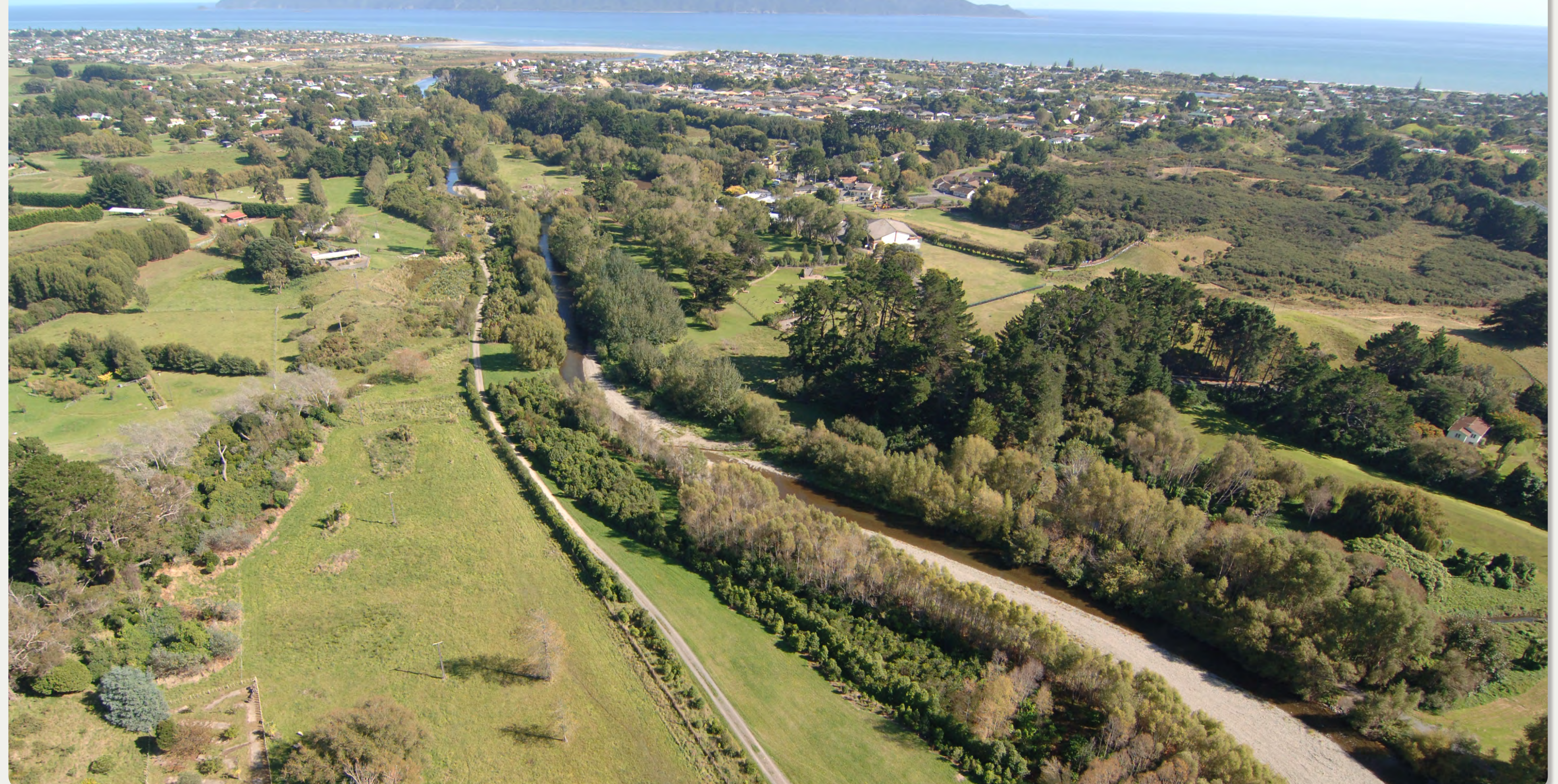
Aerial oblique view of the existing Waikanae River area - the open rural landscape is visible to the left and El Rancho is visible to the right.