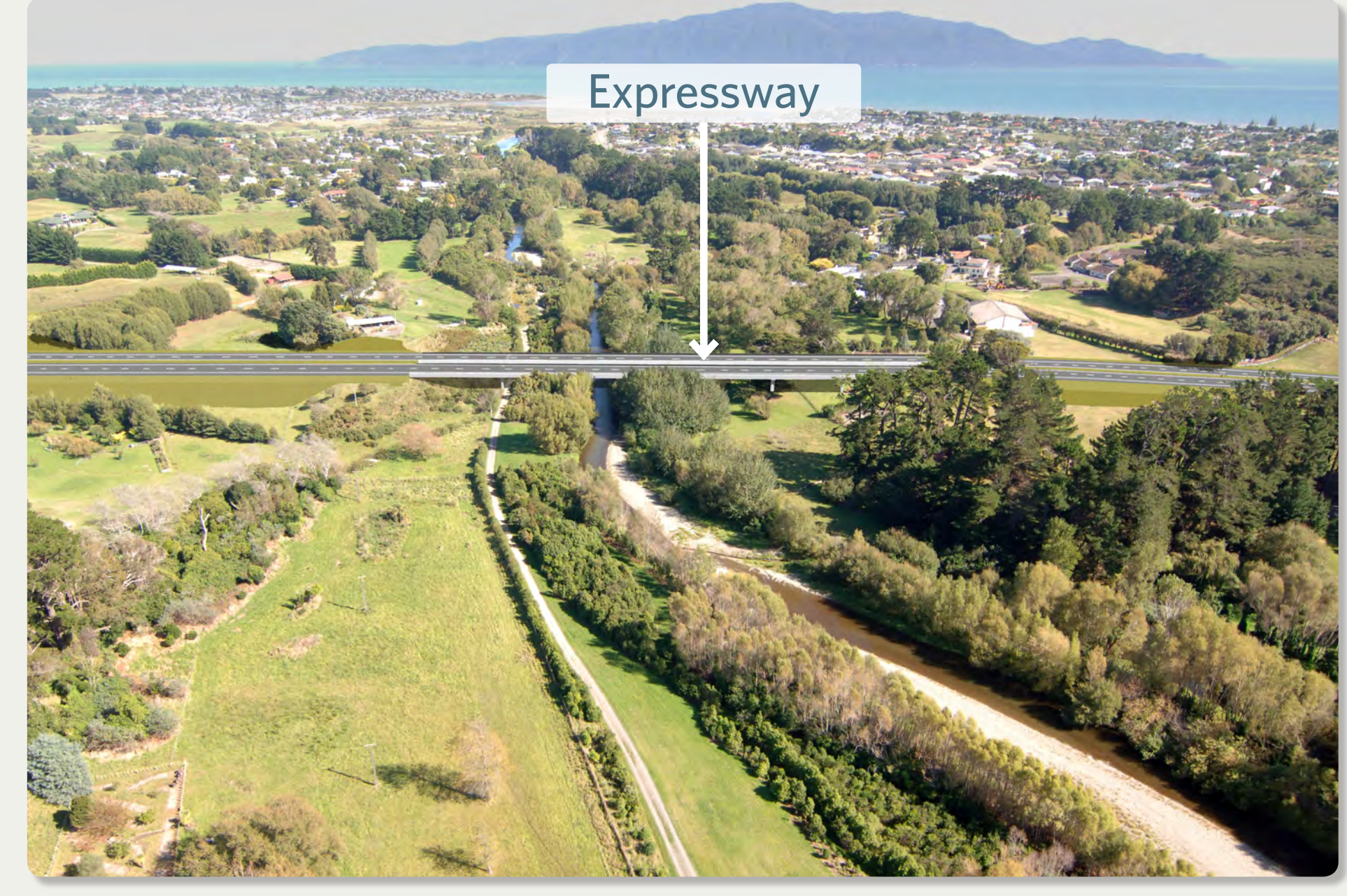
Indicative aerial view of the Waikanae River expressway bridge before mitigation work.