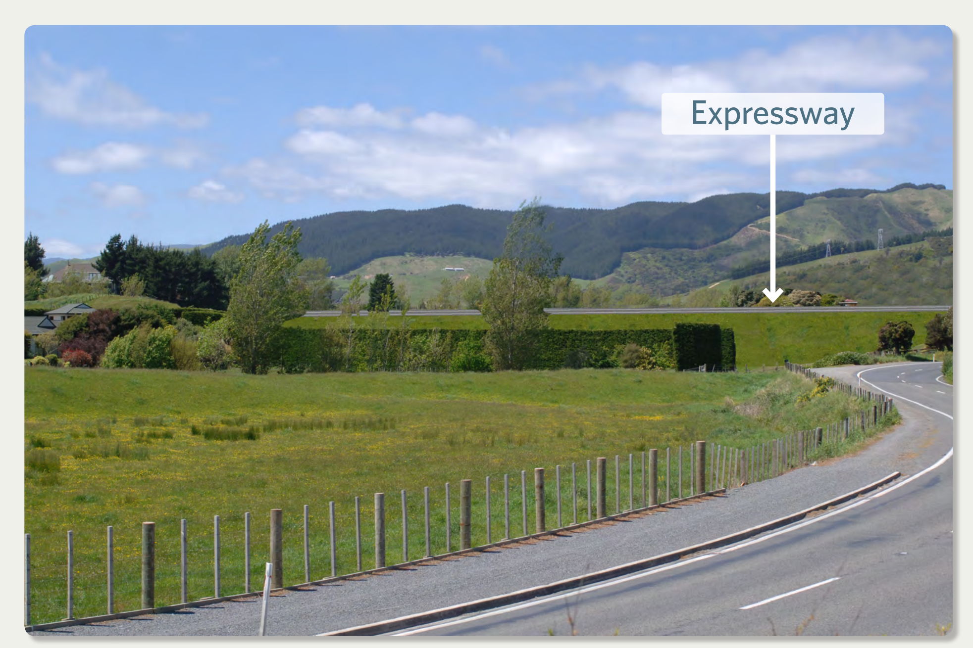
Indicative street level view looking east on Otaihanga Road - before mitigation work.