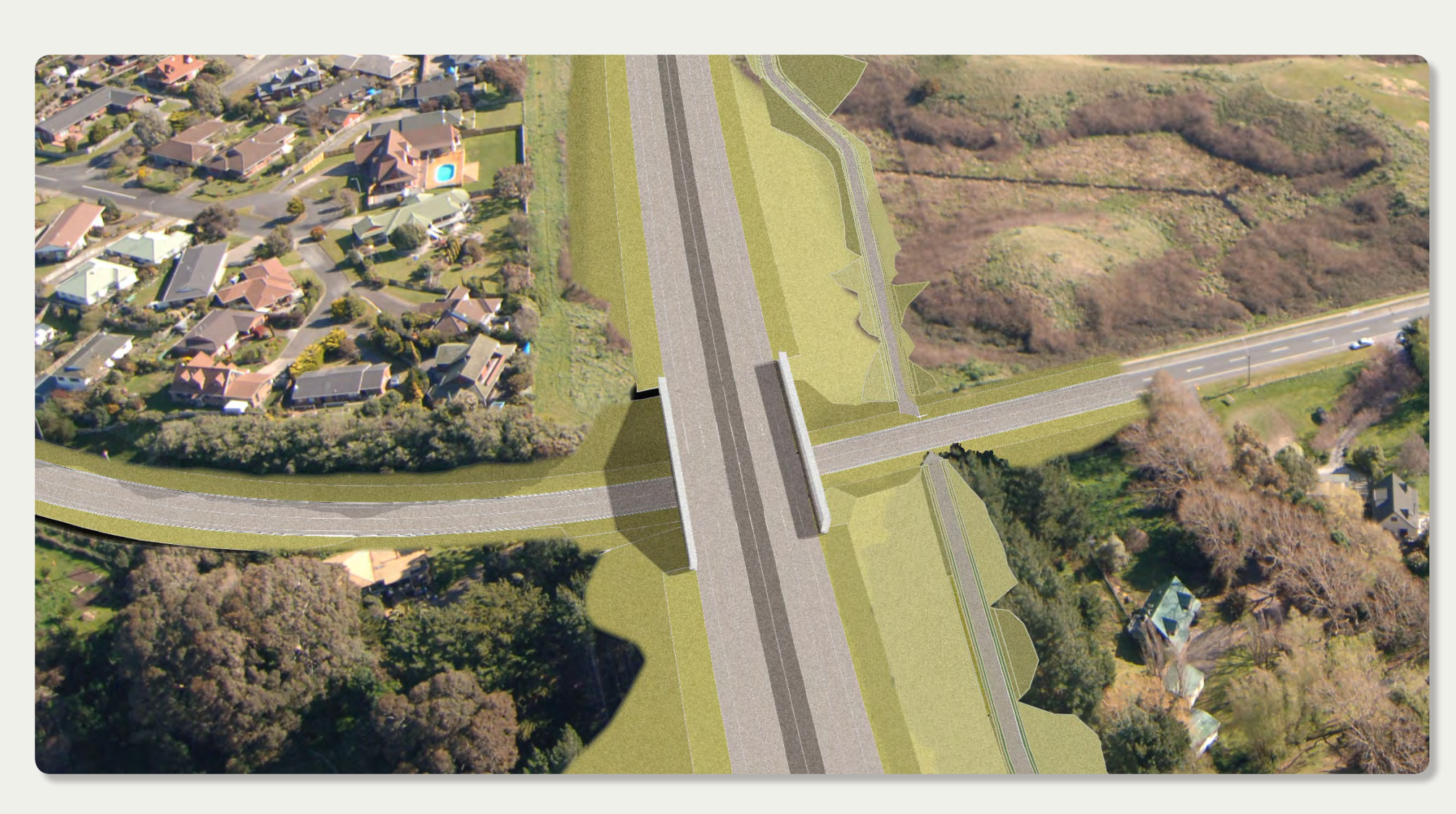
Indicative aerial view of the Mazengarb Road expressway bridge. The shared cycle/walk path can be seen on the right side - before mitigation work.

Between Mazengarb Road and Otaihanga Road there are several wetland areas. Some of these will be utilised for stormwater management and combined with ecological enhancement. One has high ecological values and will not be utilised for stormwater treatment.