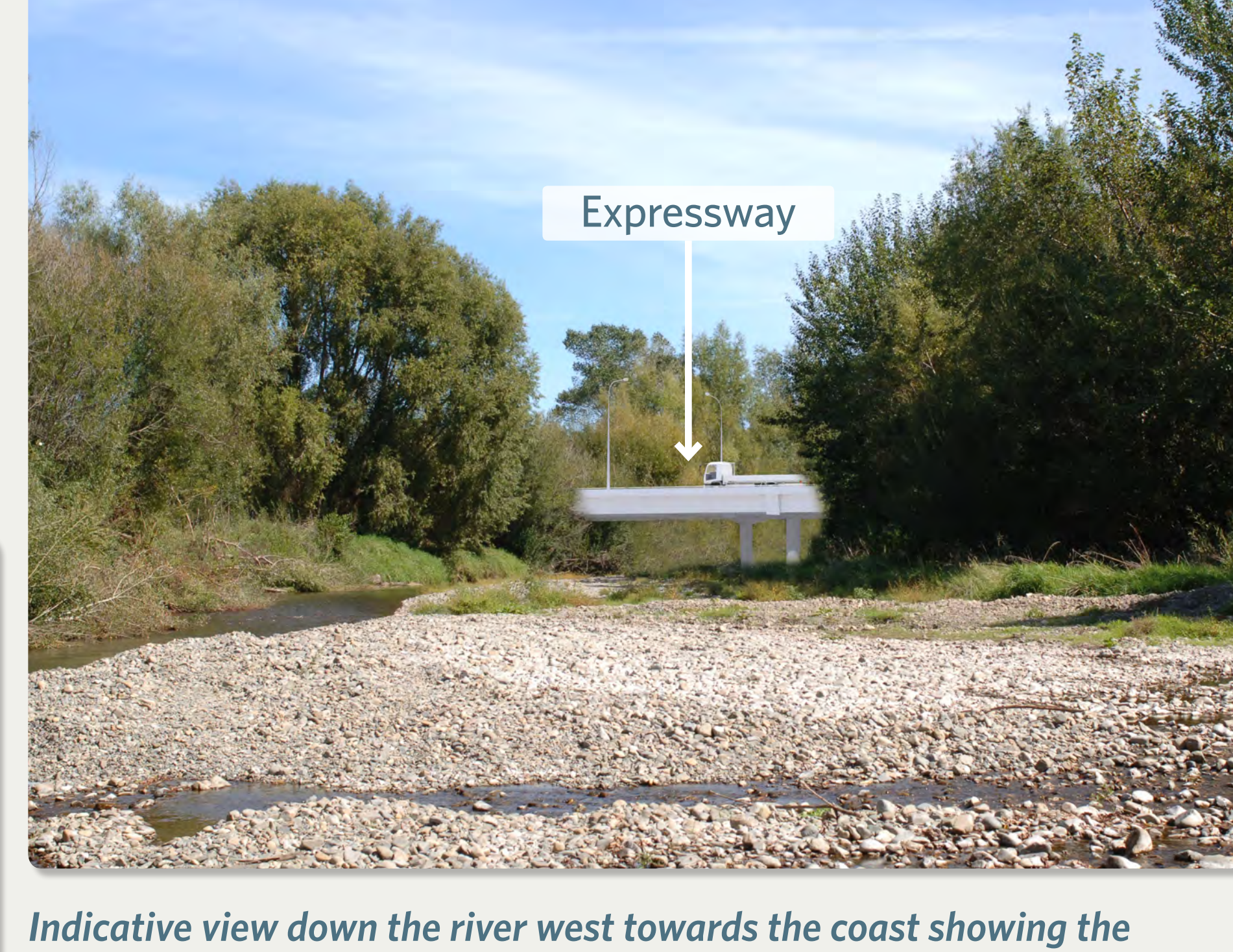
expressway crossing over - before mitigation work. The bridge design detail has yet to be undertaken.

A cycle/walk path will also cross here, to provide another crossing point in addition to the cyclist/pedestrian bridge lower down the river. A new access to El Rancho will be provided under the bridge.