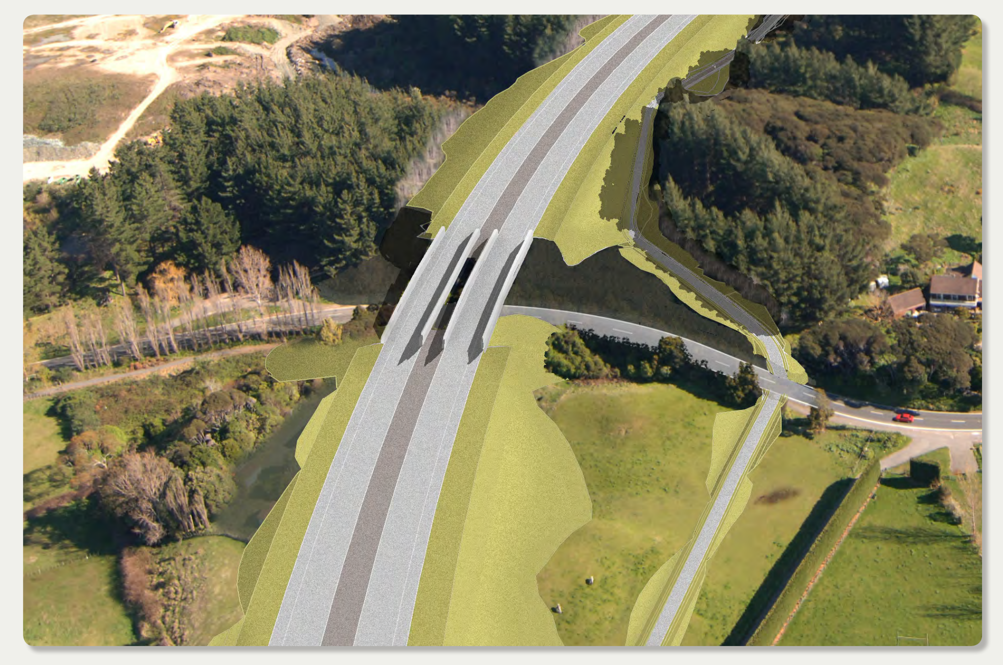
Indicative aerial view of the Otaihanga Road expressway bridge. The shared cycle/walk path can be seen on the right side - before mitigation work.