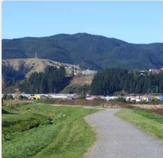
Have we missed anything?