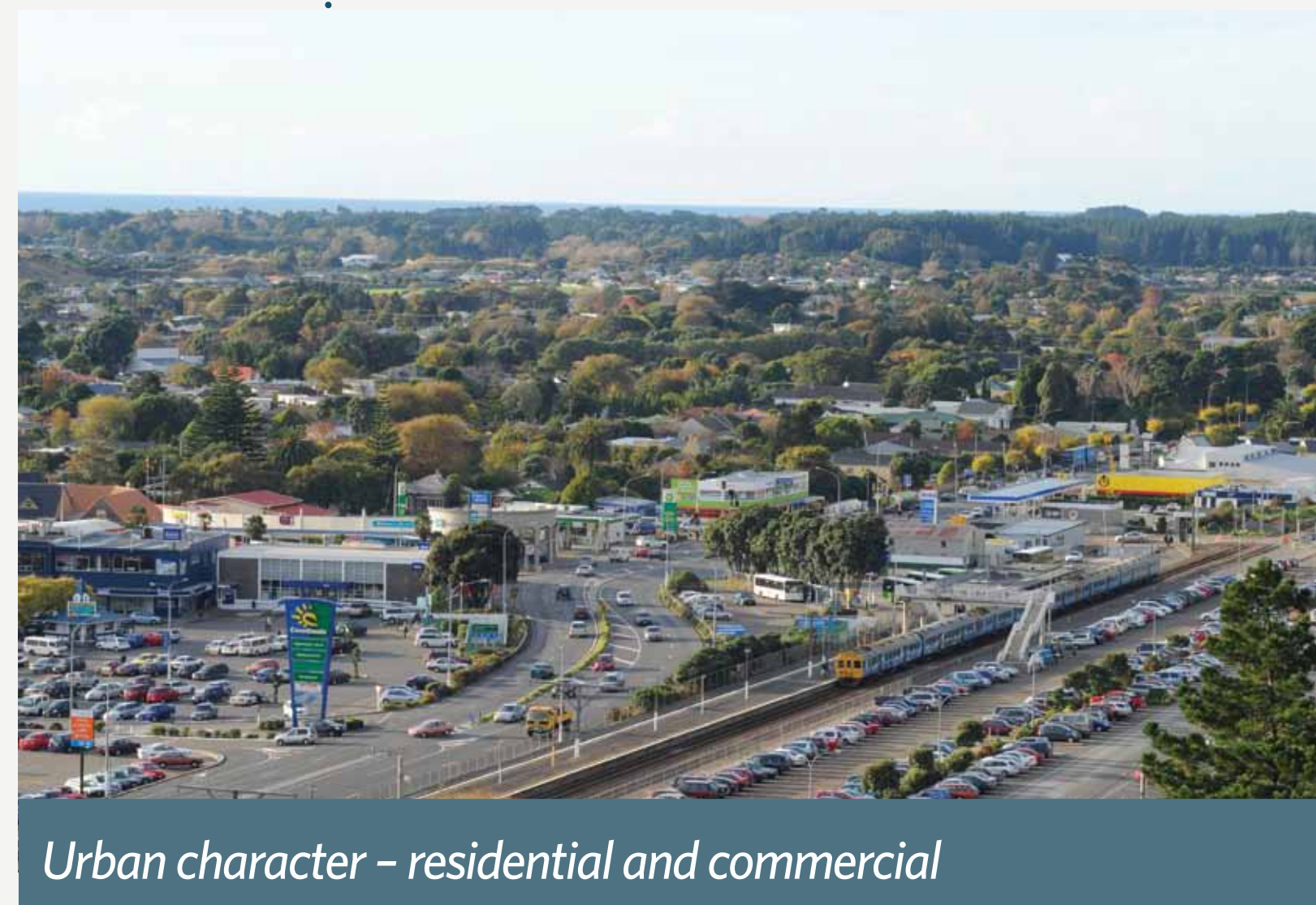
Urban character - residential and commercial