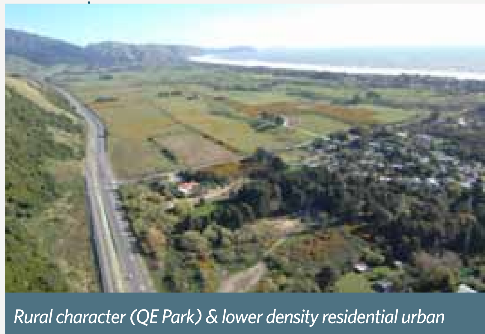
Rural character (QE Park) & lower density residential urban

Different stretches of the current State Highway 1 have different settings and will require different treatment.