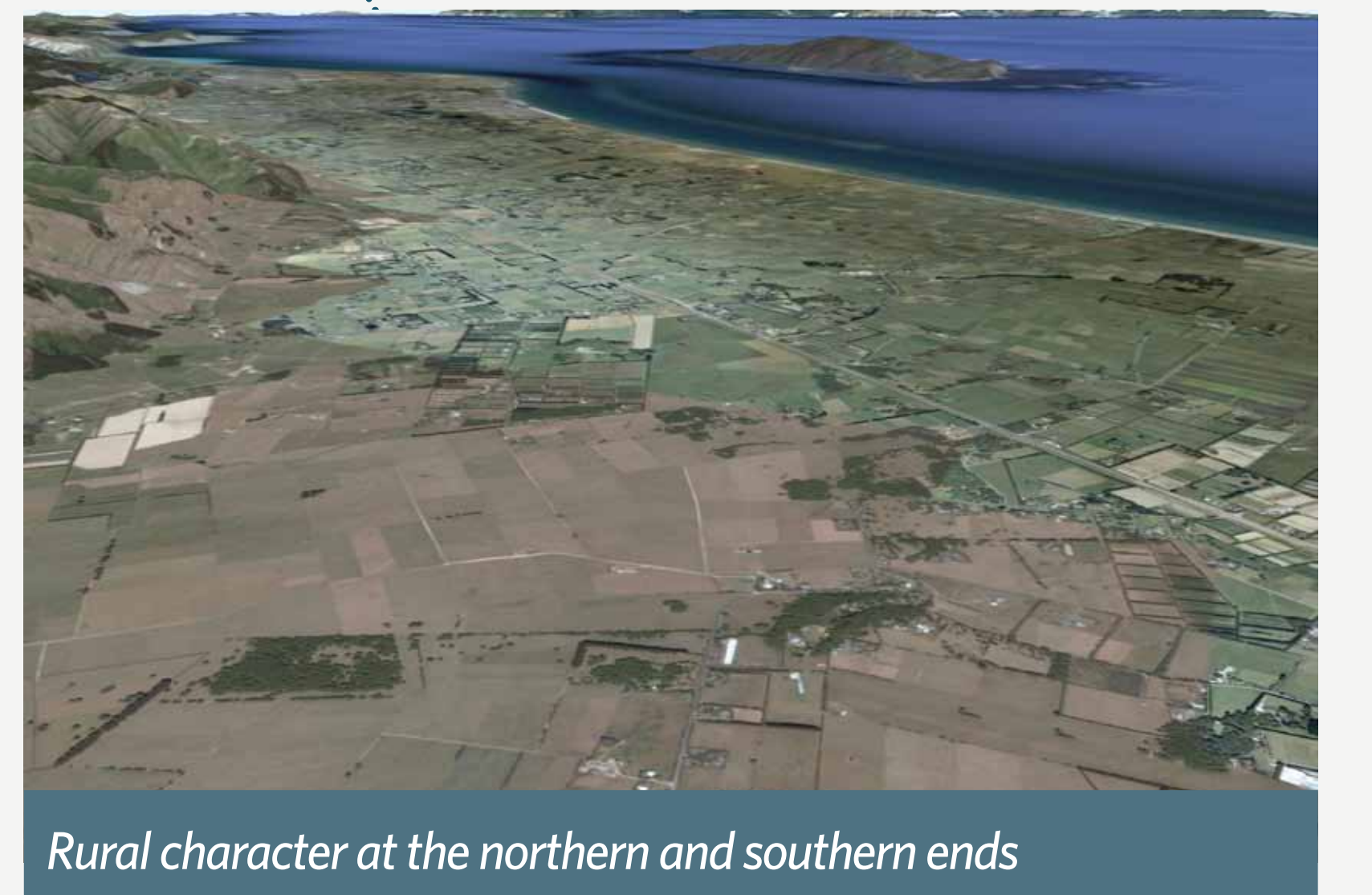
Rural character at the northern and southern ends