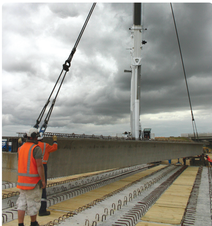
Installing the beams on the Roscommon Road bridge over the Puhinui Stream.

These milestones put the project in a good position for the final summer construction season and upcoming completion in August 2010.