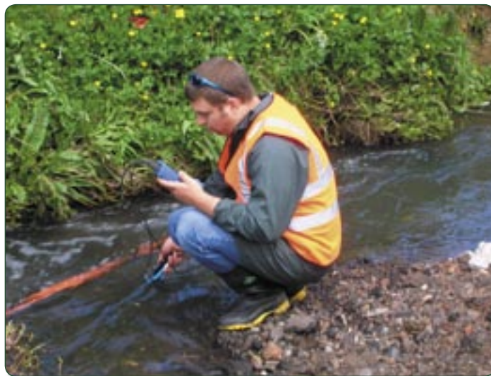
Water quality is measured at Puhinui Stream

Once work is underway new samples will show if the stream's oxygen and pH levels have changed.