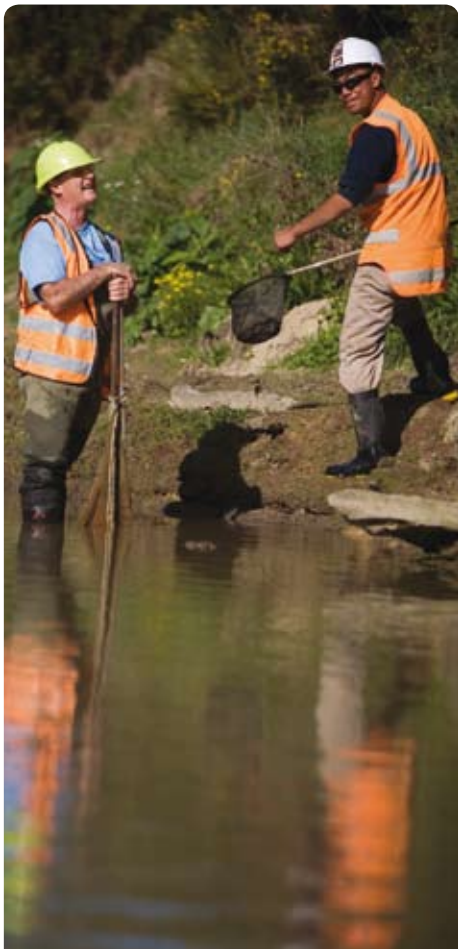
Fish relocation is supervised by fresh water ecologists.

To complete the motorway project, the team will have to realign the Puhinui Stream and construct the Roscommon - Puhinui connecting road, and this will involve a series of challenging tasks.