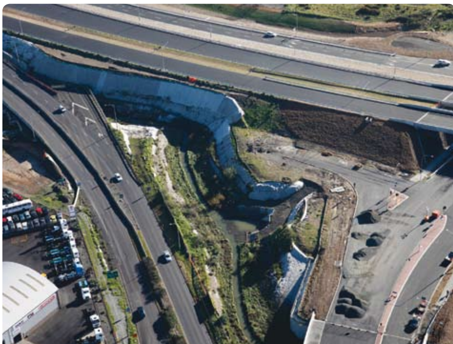
To complete the project the team have to realign the Puhinui Stream, demolish a stretch of the old SH20 route and construct the new Roscommon - Puhinui connecting road.

When the correct height has been reached, the road pavement will be constructed, and the connecting road will be opened in December.