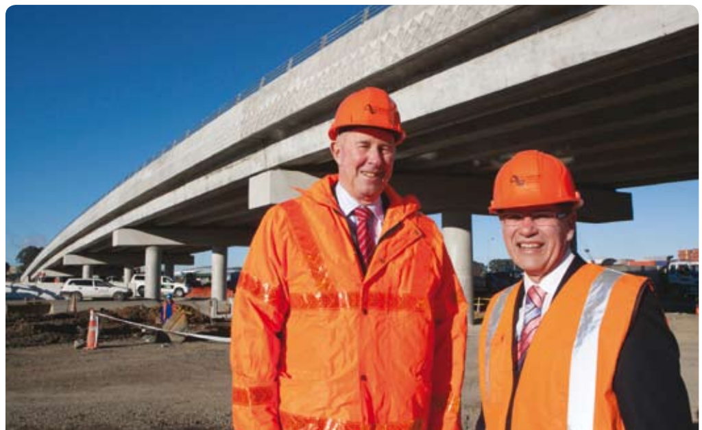
NZ Transport Agency Regional Director Wayne McDonald with Manukau City Mayor Len Brown by Plunket Avenue Bridge. NZTA has worked closely with Manukau City Council during the construction of the SH20-1 Manukau Extension.

The Cavendish Drive Interchange will connect the industrial areas around