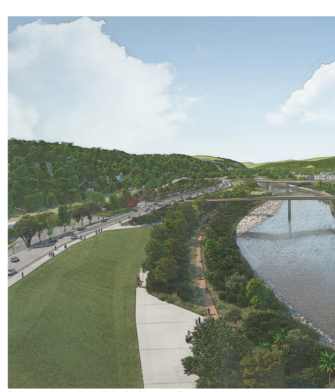
Ге Awa Kairangi / Hutt River looking north