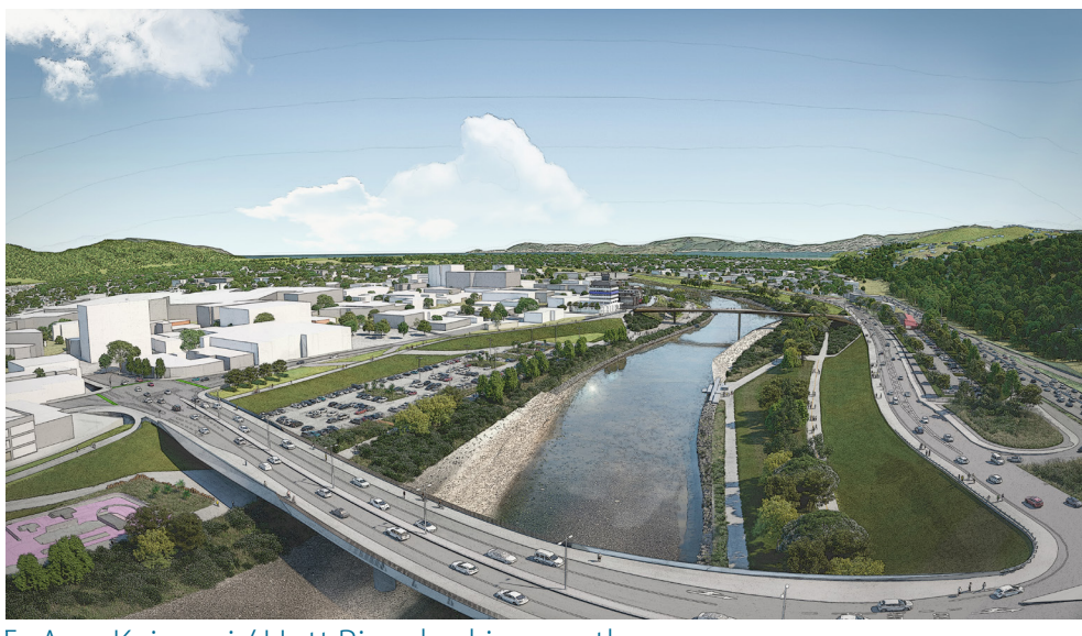
Ге Awa Kairangi / Hutt River looking north