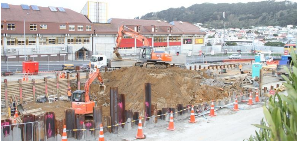
Looking across the eastern end of the site toward Te Papa Archives