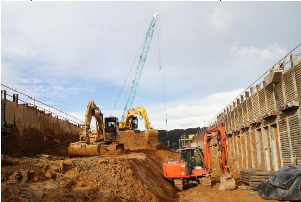
Excavation of central trench – western portal of future underpass tunnel