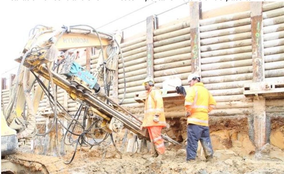
Drive machine screwing ground anchors in place