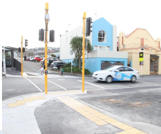
Tactile paving extended at Tory Street lights

Watch out for: Trucks and trailer units taking soil away from the site. Motorists, please be aware of the "trucks crossing" warning sign installed by the site just past the Tory Street intersection.