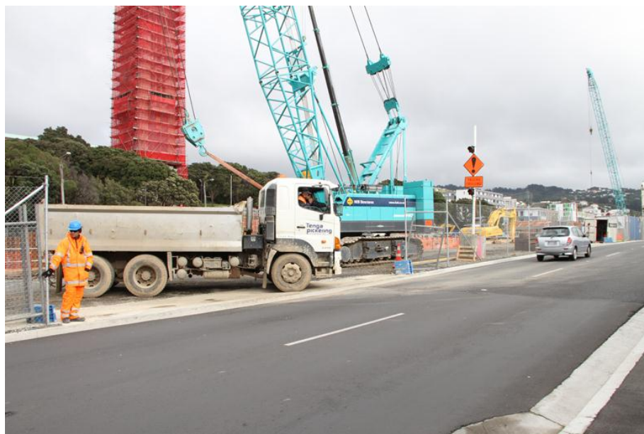
Trucks crossing" sign on site fence just past Tory Street intersection