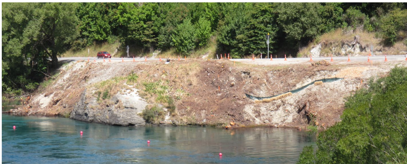
The cleared south bank of the new bridge construction site

Users of the current single lane bridge will have noticed in recent weeks that as shown in the photo above, willow trees have been removed from the southern river bank. This will provide an area to launch the curved portion of the new two-lane bridge out over the river. Site preparation on the northern bank will start once power lines across the river are re-routed underground and via the existing bridge. This work is due for completion before the end of February.