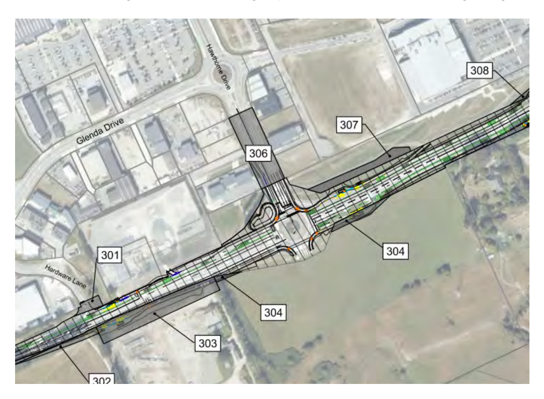
Figure 3: Designation Plan - Hardware Lane to just east of Grant Road

18. Figures 3 – 6 below are excerpts from the designation plans. The areas shown shaded in grey depict the proposed alteration to Designation 84 and the new designation for the bus hub. The diagonal cross hatching depicts the extent of the existing designation.