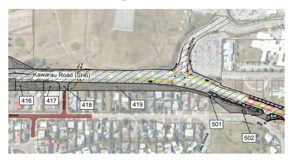
Figure 6: Designation Plan - SH 6 (Kawarau Road), north of Ross Street to Boyes Crescent