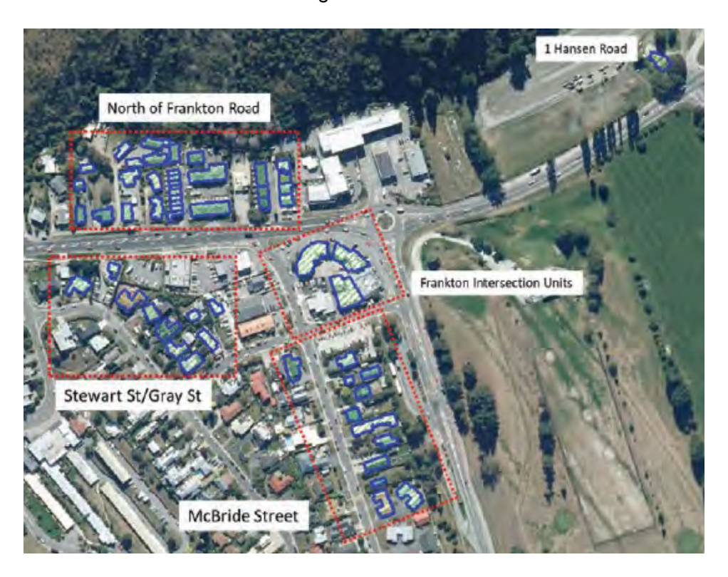
Figure 8: Overview of PPFs locations