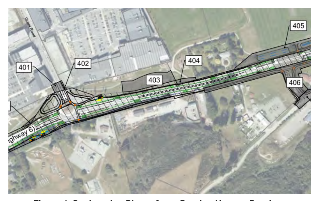
Figure 4: Designation Plan - Grant Road to Hansen Road