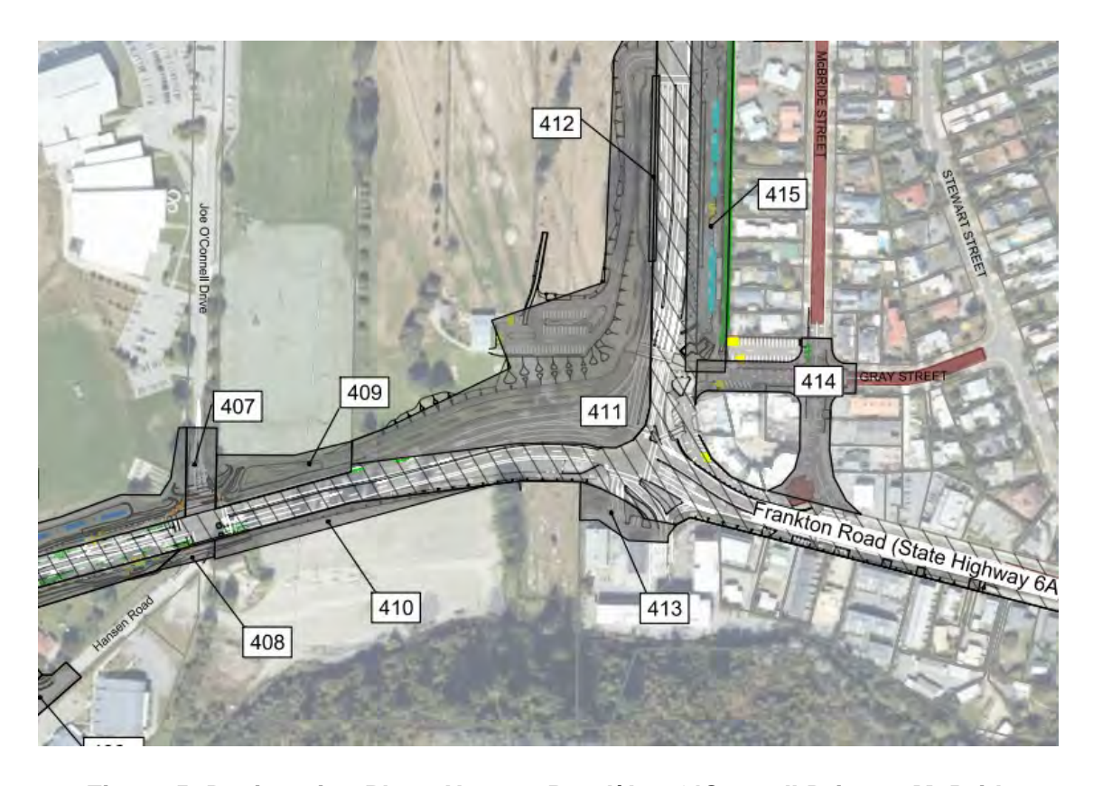
Figure 5: Designation Plan - Hansen Road/Joe O'Connell Drive to McBride Street/SH 6A intersection and SH6 (Kawarau Road), with proposed bus hub designation also shown