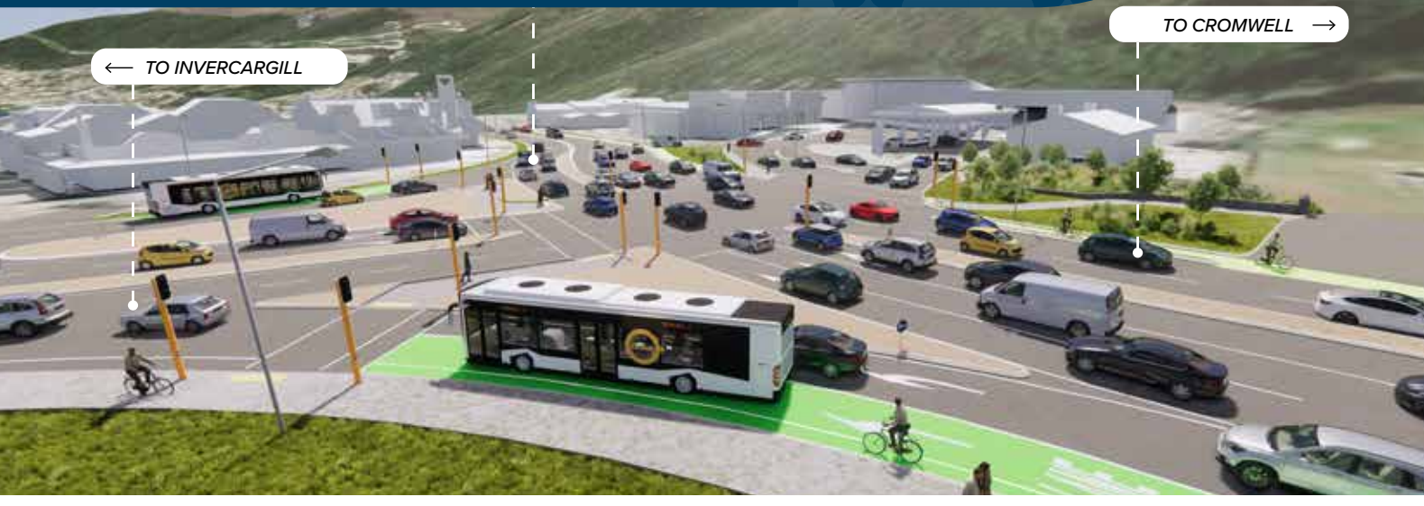
An artist impression of the new SH6/6A intersection

The aim of the New Zealand Upgrade Programme is to provide dedicated infrastructure to support improved public transport services. It includes bus priority measures on State Highway 6/ State Highway 6A, bus lanes on SH6, improvements to the existing Frankton bus hub, improvements to the SH6A/SH6 intersection, pedestrian access improvements across SH6 and SH6A and a new roundabout at Howards Drive.