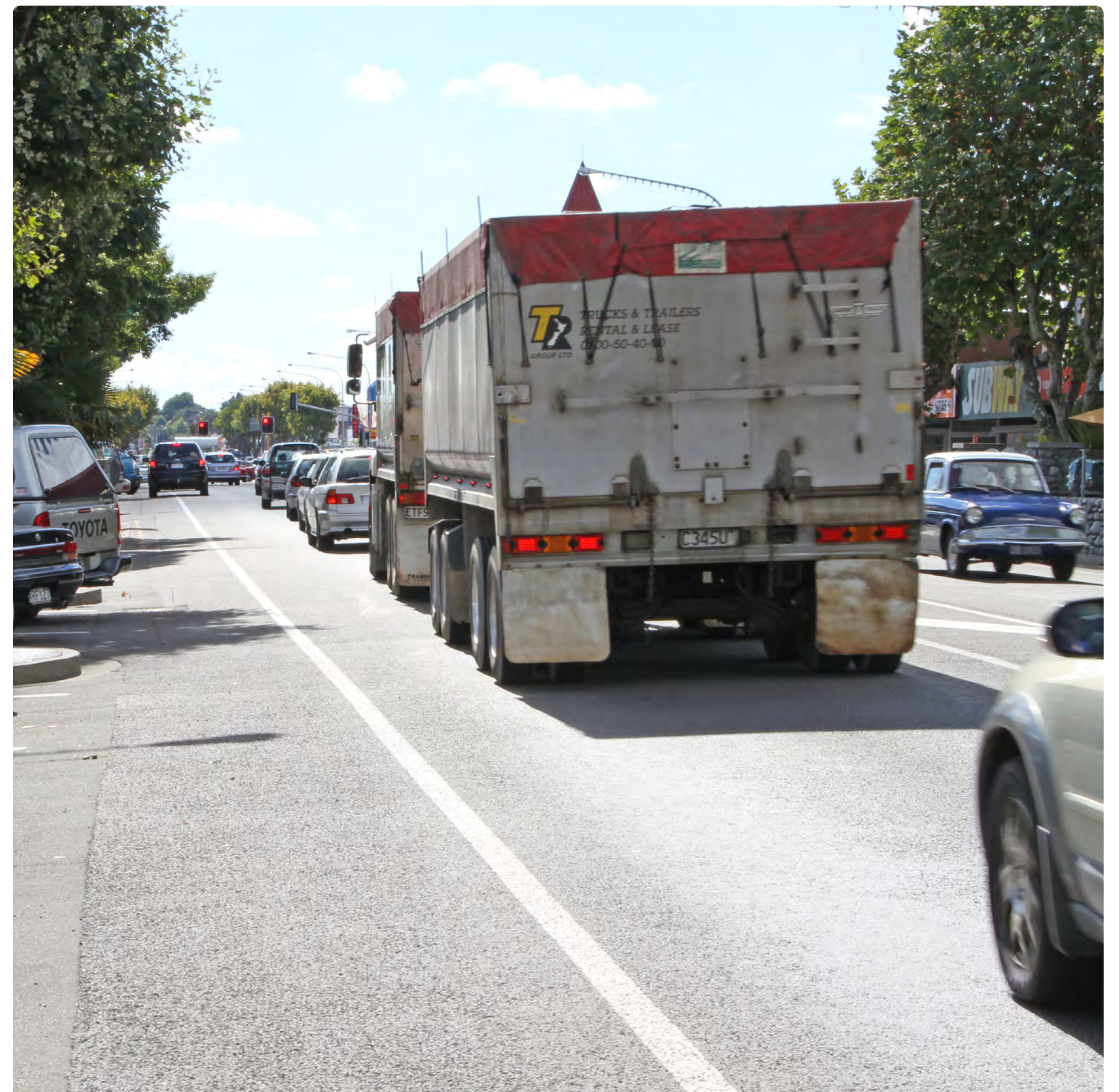
A high number of vehicles travel through Levin, including heavy vehicles.