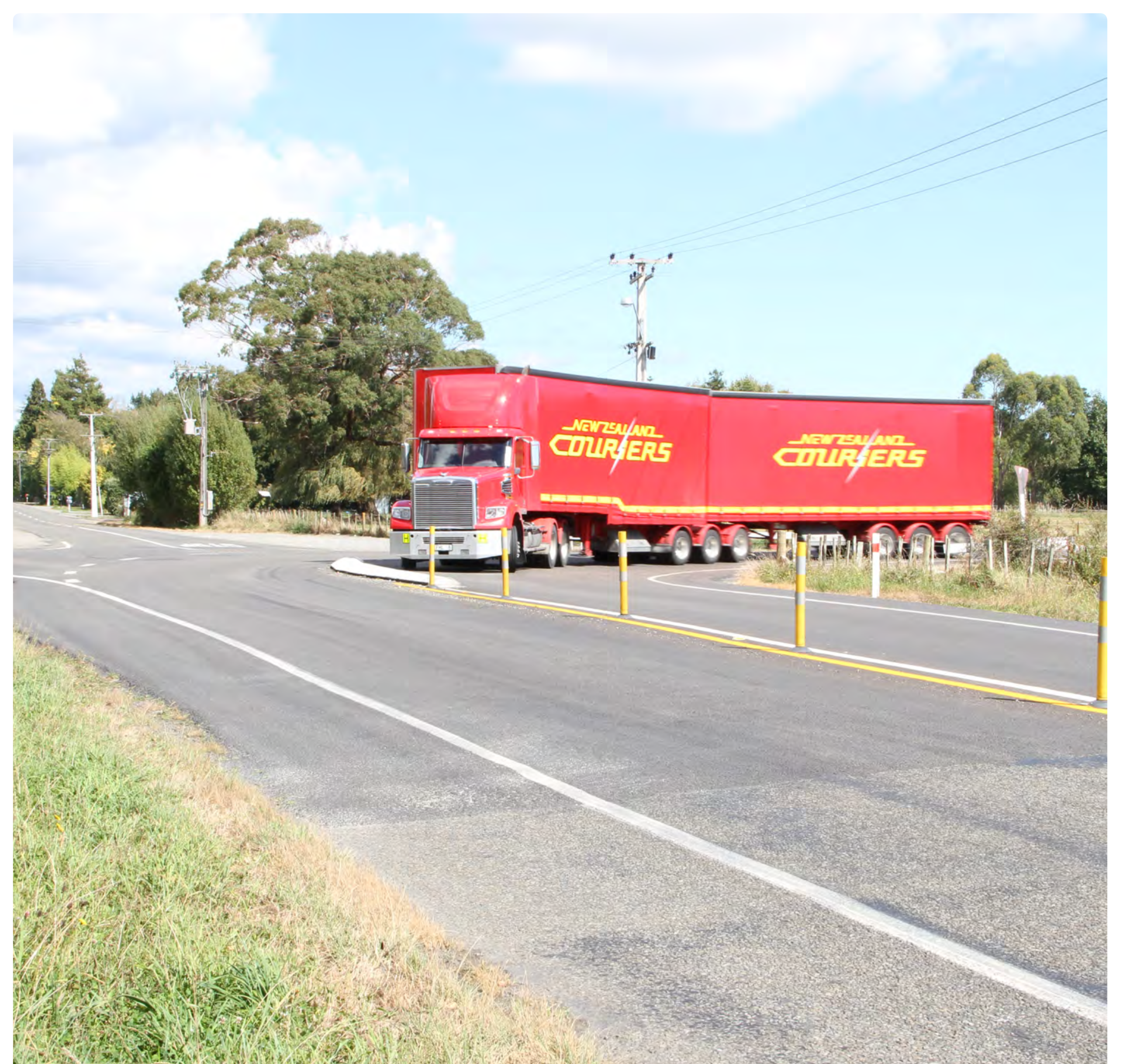
The SH57/ Arapaepe Road intersection is seen as problematic from a safety and efficiency perspective.