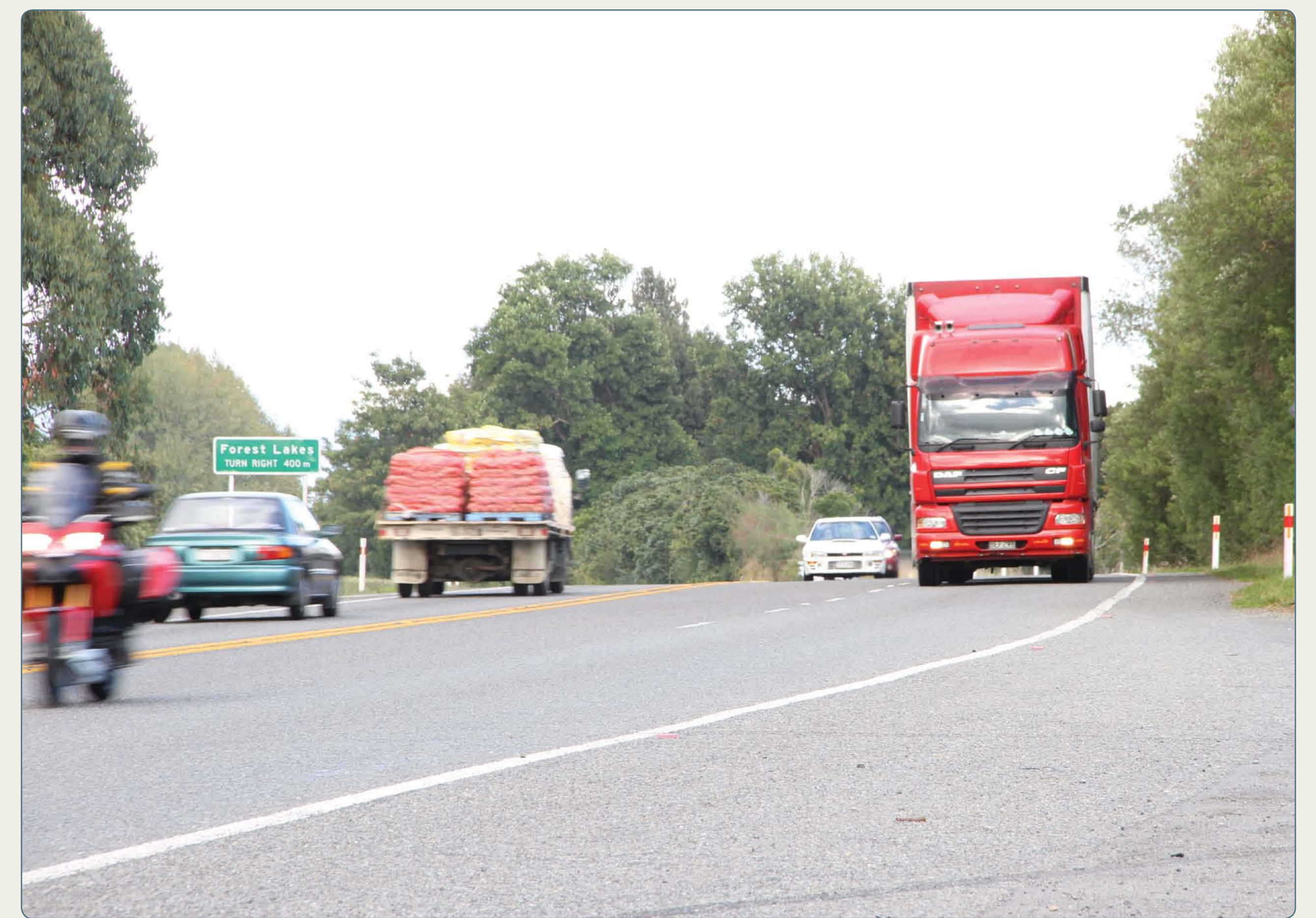
Looking south at Forest Lakes the mix of traffic that use the highway is clear.

Is there anything else we should consider at this location?