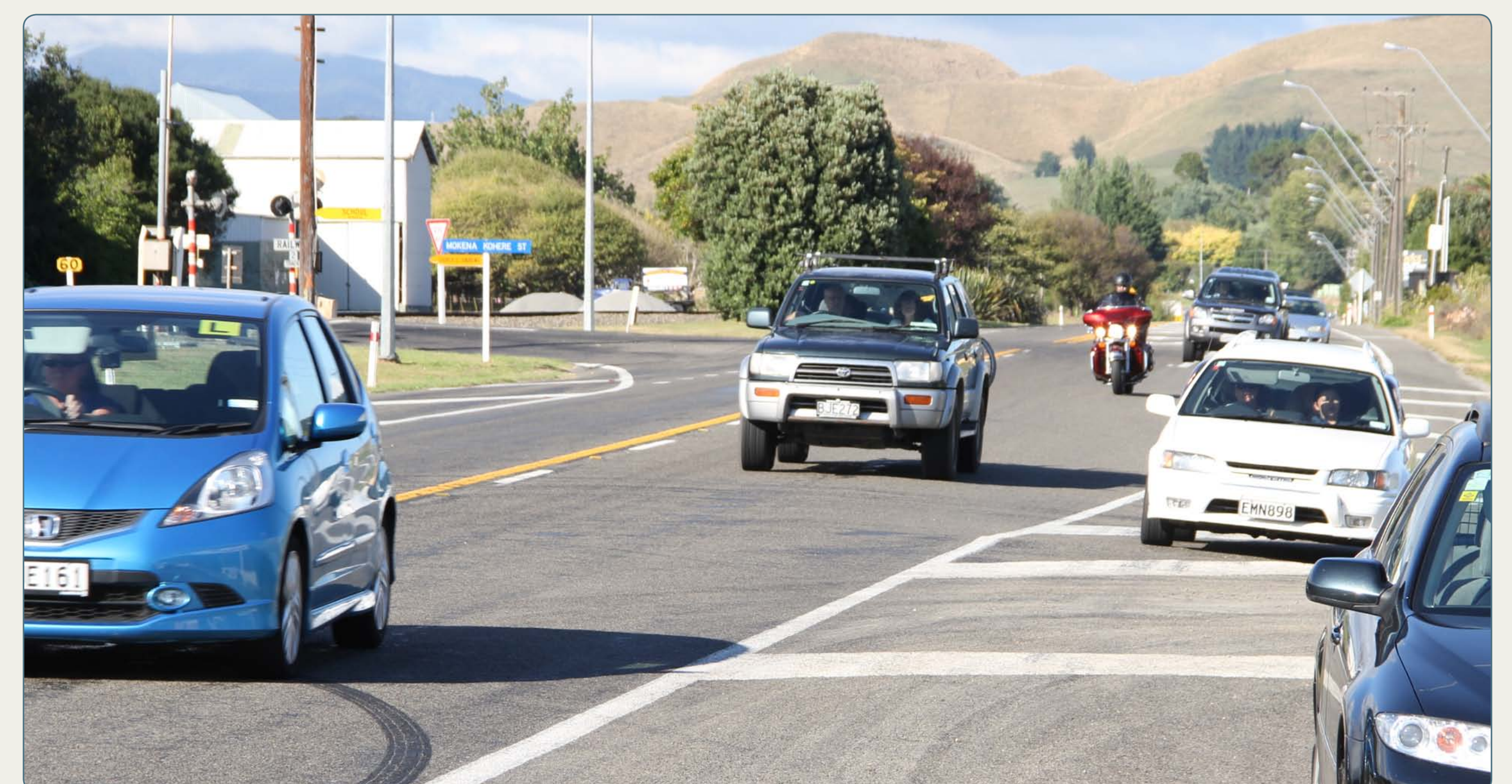
Looking south, this is the area where our proposal would realign the road to give more waiting space on Mokena Kohere Street (intersection visible on the left).