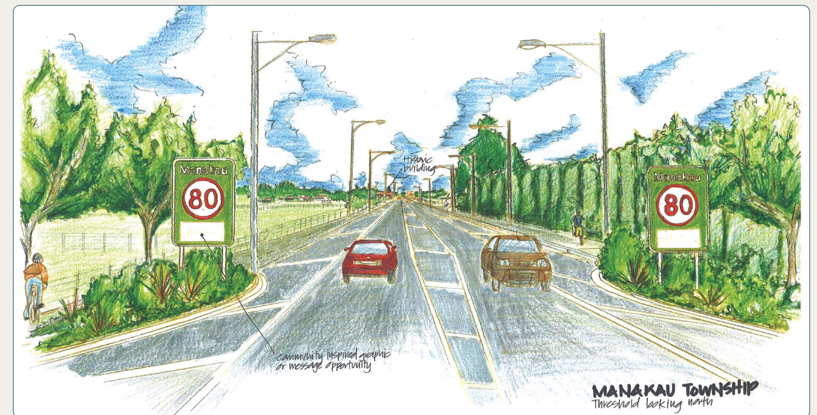
An artists' impression of how the entry to Manakau Township could be modified.

Is there anything else at this location that we should consider?