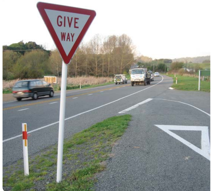
SH1 south of Levin