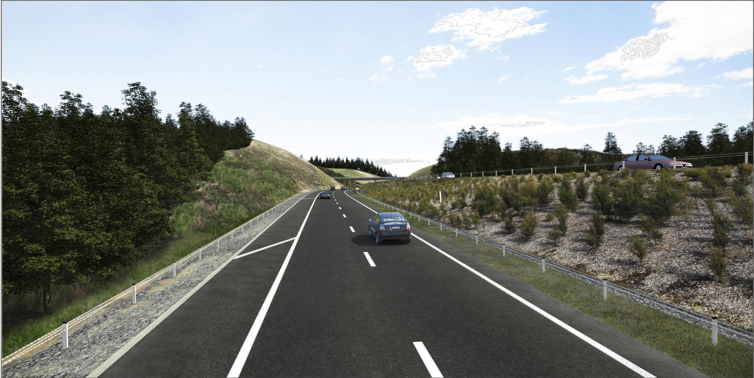
Digital Render 05 - Motorway Moirs Hill

S:\Further North - PAA\300 Design\300.5 Technical\01-Drawing Production\CAAD\Drawings\LV-217.dwg Plot Date: 19 August, 2013 - 2:09 PM