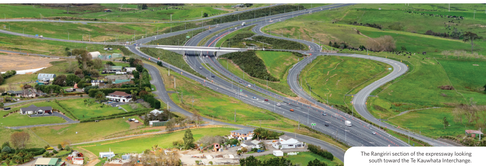
The Rangiriri section of the expressway looking south toward the Te Kauwhata Interchange.

Day and night shifts will operate from Sunday nights to Thursday nights, with Friday as a contingency. Hours are 7.30am-4.30pm and 6.00pm-4.00am.