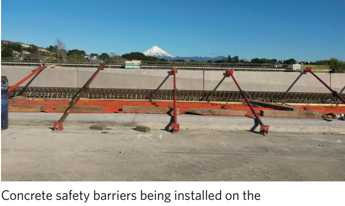
new Waiwhakaiho Bridge.