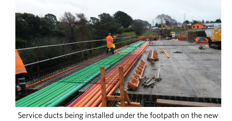
Te Henui Bridge.

You may have noticed some work happening under the Paynters Avenue over-bridge. We're cutting back the wall to make more room for the road. To hold up this new concrete wall we're installing anchors into the ground behind it. These are a bit like the 'butterfly anchors' you might use at home to hold up picture frames on gib walls - only much stronger!