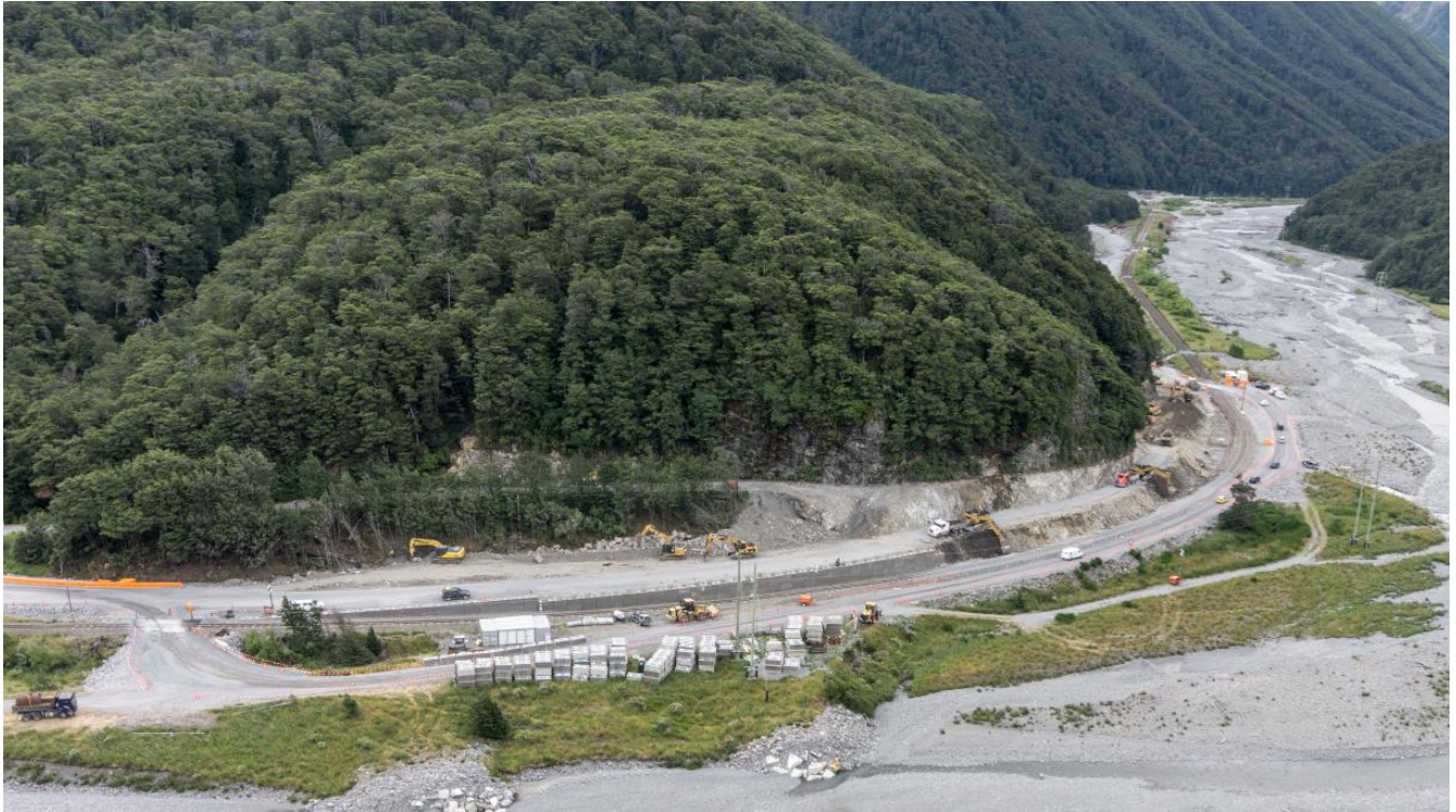
Work on Mingha Bluff when the last detour was in place.