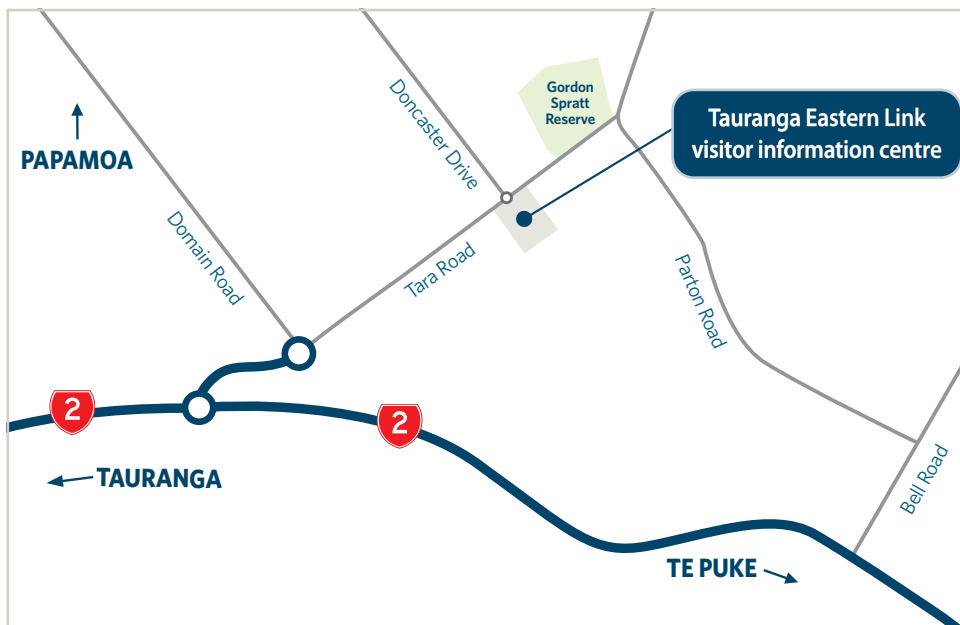
TEL visitor information centre at 65 Tara Road