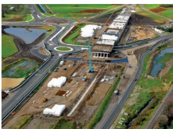
Domain Road interchange 2014

Please note: There is no public access to any part of the TEL construction site.