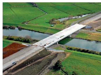
Kaituna River bridge and Bell Road 2014