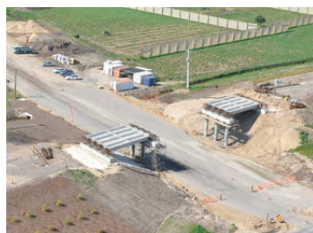
Parton Road overbridge August 2014