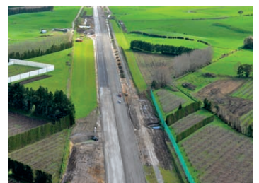
Te Tumu Road to Pah Road August 2014